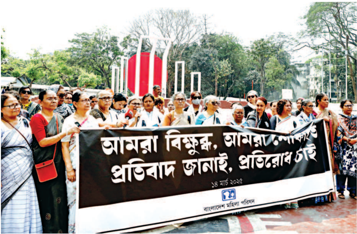
Bangladesh Mahila Parishad yesterday held a rally in front of the Central Shaheed Minar in the capital. They pointed to the recent rise in incidents of rape and gender-based violence throughout the country, particularly the incidents of children being raped. Speakers at the protest demanded that the interim government take immediate action to bring this situation under control. Afterwards, they marched towards the Jatiya Press Club, before ending it at their Shegunbagicha office.