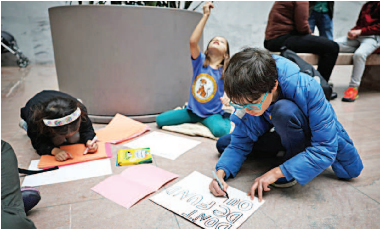
Children create signs during a rally in the Hart Auditorium in support of the Department of Education and School at the U.S. Capitol yesterday in Washington, DC. Earlier this week, the House passed a continuing resolution that would cut over $1 billion from DC’s budget, potentially leading to layoffs and reduced public safety, school, and transportation services.

Cuts to US foreign aid under President Donald Trump have caused a “seismic shock” to global humanitarian work, a UN agency head said, warning that “many will die” as a result. Tom Fletcher, head of the UN Office for the Coordination of Humanitarian Affairs (OCHA), estimated that 300 million or more people are in need of humanitarian support worldwide, and that “the pace and the scale of the funding cuts that we’ve faced are, of course, a seismic shock to the sector.” Since Trump returned to office in January, the United States Agency for International Development (USAID) has been in the crosshairs of his administration’s quest to slash government spending, with ripple effects already felt around the globe.