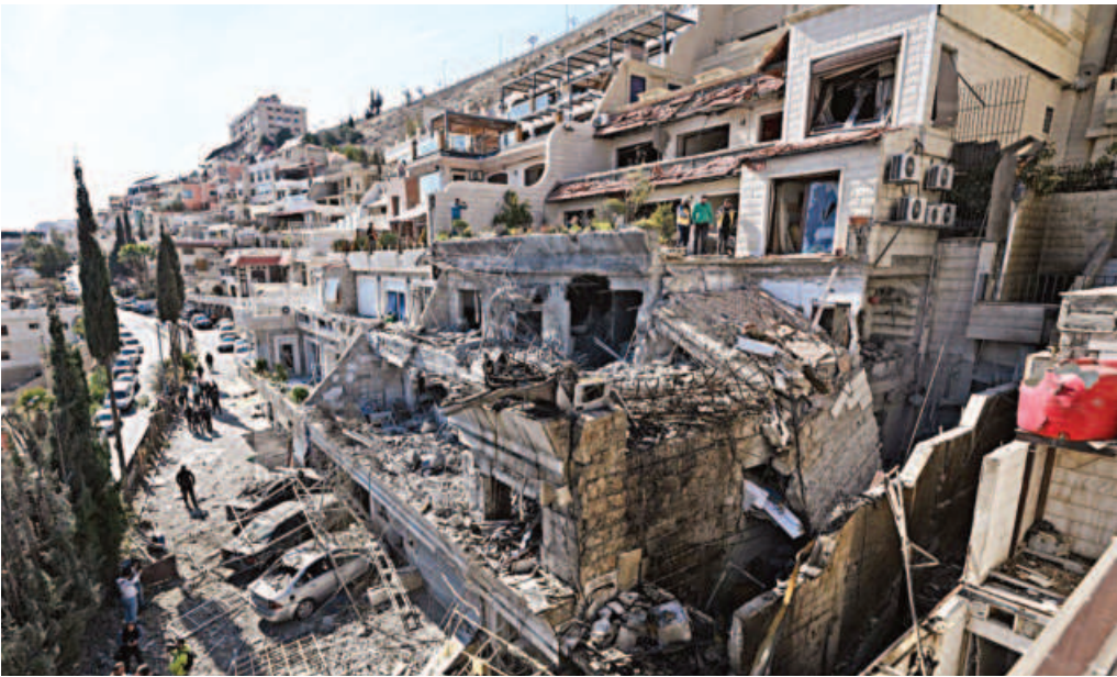
Syrian security forces inspect the site of an Israeli air strike on a building in Damascus in an area where Palestinian leaders are known to reside yesterday.