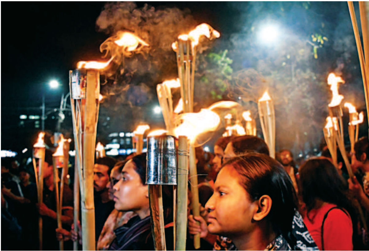
Protesters carrying lit torches march on Dhaka University campus under the banner of Bangladesh Against Rape and Abuse yesterday evening. Top right, former and current DU journalism students demonstrate in front of Raju Sculpture. Bottom right, students of printing and publications department take out a procession.