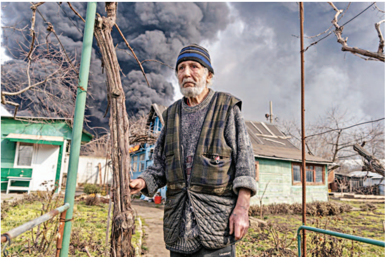
A resident stands in the courtyard of his house while smoke rises from a fire following a strike on the outskirts of Odessa yesterday. Story on page 12.

AFP, Brussels The EU is expected to open the way for member states to set up migrant return centres outside the bloc – a highly contentious idea – following pressure from governments to facilitate deportations. “We want to put in place a truly European system for returns, preventing absconding, and facilitating the return of third-country nationals with no right to stay,” commission chief Ursula von der Leyen said Sunday. A souring of public opinion on migration has fuelled hard-right electoral gains in several EU countries, upping pressure on governments to harden their stance. Led by immigration hawks including Sweden, Italy, Denmark, EU leaders called in October for urgent new legislation to increase and speed up returns and for the commission to assess “innovative” ways to counter irregular migration.