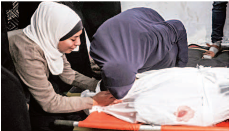
Women mourn over the body of man who was killed in overnight Israeli bombardment on a refugee camp in Gaza Strip yesterday.