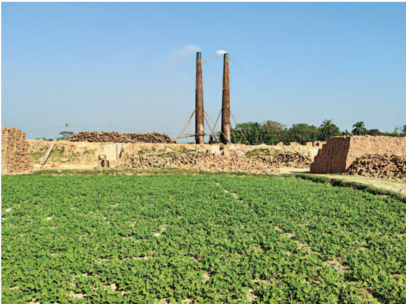
A brick kiln in Charfesson, Bhola, has been built on farmland. The owners source clay from the topsoil of neighbouring fields and burn wood to run the kiln, both harmful to the environment and illegal.