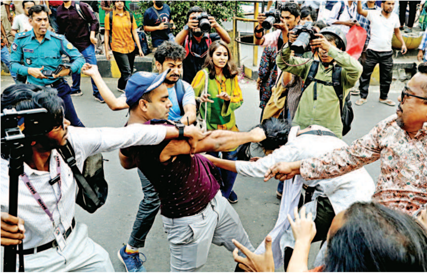
A police officer in plainclothes grabs a female protester by her hair near Intercontinental hotel in the capital yesterday. Anti-rape protesters and cops engaged in fistfights and shoved each other when the protesters tried to get to the chief adviser's residence to submit a memorandum.