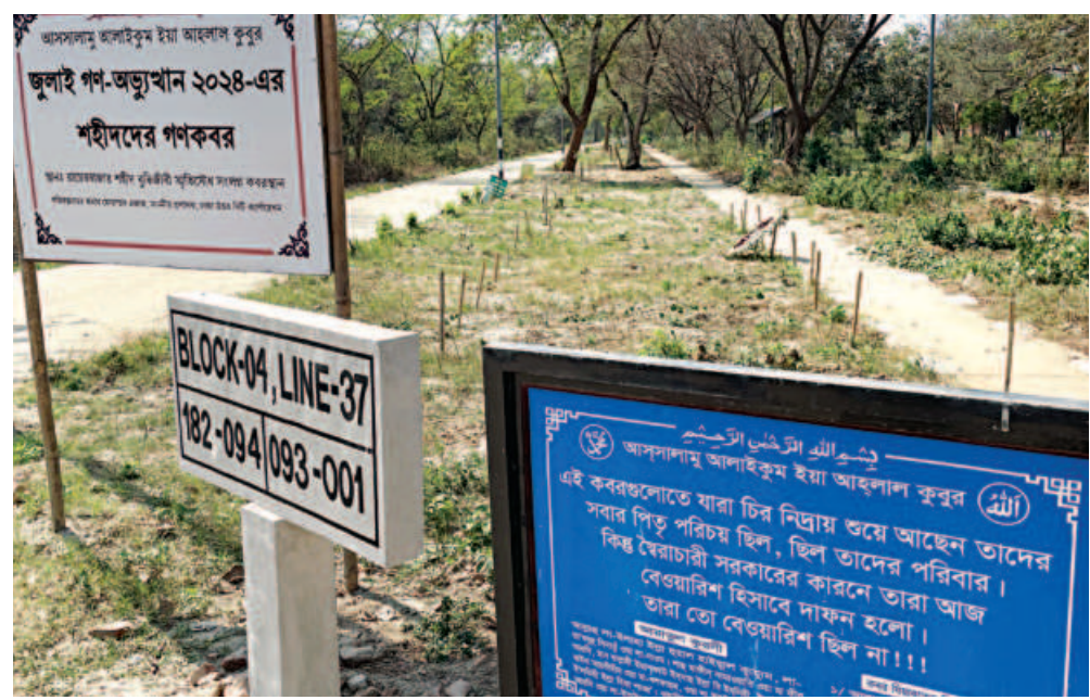
In Block 4 of Rayerbazar graveyard lie many unidentified victims of the July atrocities.