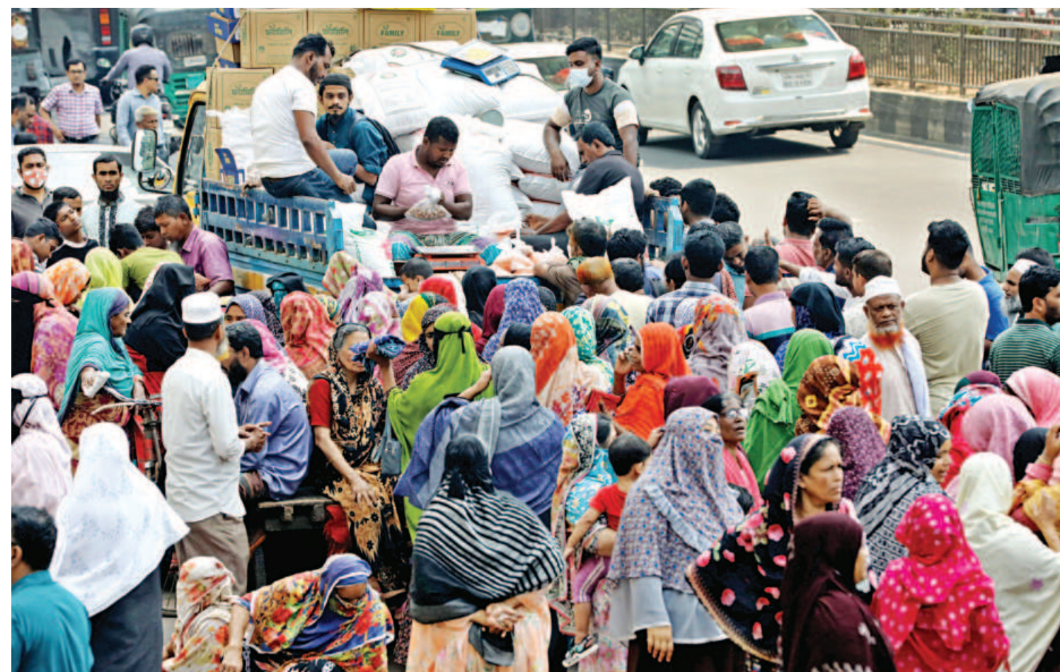
A large crowd behind a mobile shop of the Trading Corporation of Bangladesh. Most of the people in the queues came to the spot on Kazi Nazrul Islam Avenue hours before the truck with subsidised goods arrived around 2:00pm.