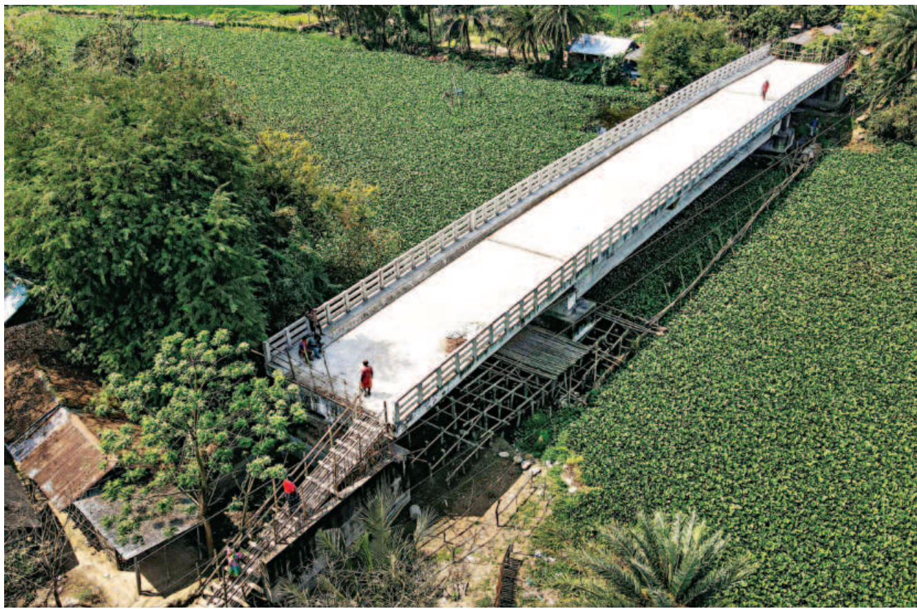
Construction of the bridge in Badurgacha area of Dumuria, Khulna, was completed eight years ago. But the only way to access the bridge is the rickety staircase made of bamboo and wood as the authorities could not build roads because they had not acquired land on either side of the structure.