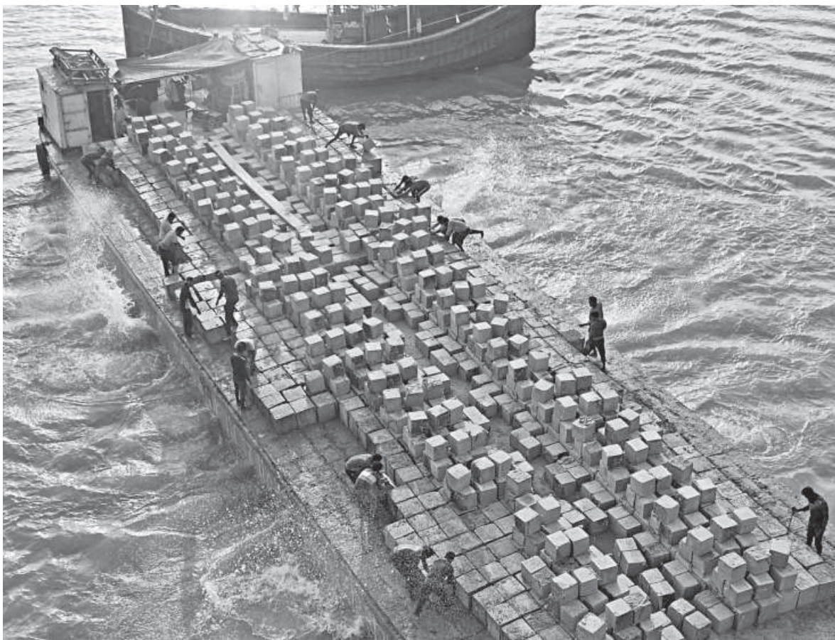
Workers dropping cement, stones, and sand blocks around the pillars of the Captain Mohiuddin Jahangir Bridge (Doarika Bridge). This initiative was taken due to the increased current along the Sugandha River on the Barishal-Dhaka highway. The photo was taken from the Babuganj upazila in Barishal yesterday.