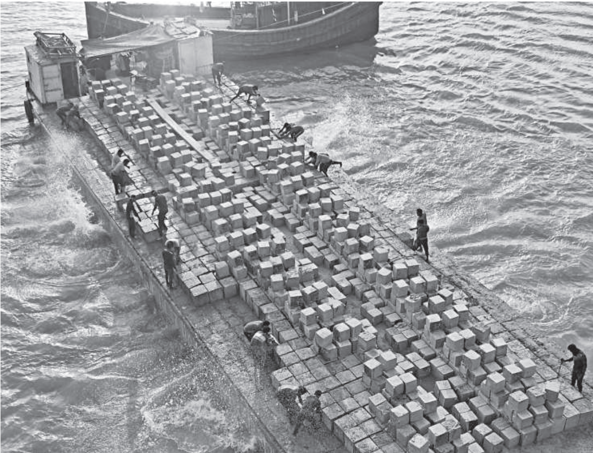
Workers dropping cement, stones, and sand blocks around the pillars of the Captain Mohiuddin Jahangir Bridge (Doarika Bridge). This initiative was taken due to the increased current along the Sugandha River on the Barishal-Dhaka highway. The photo was taken from the Babuganj upazila in Barishal yesterday.