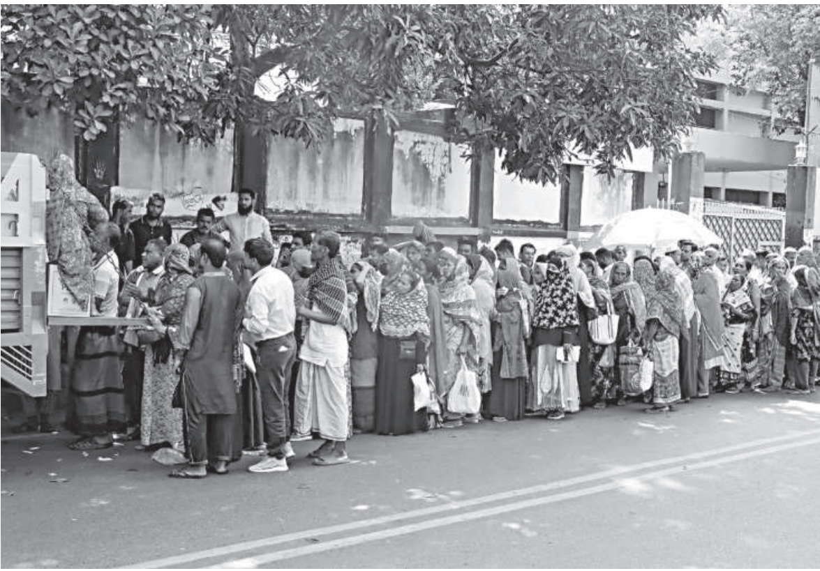
A large queue has assembled behind this TCB truck in front of the Bangladesh Bank in Khulna city. With Ramadan underway, such facilities are the only hope for low-income groups to afford essential commodities like sugar, oil, and lentils. The photo was taken recently.