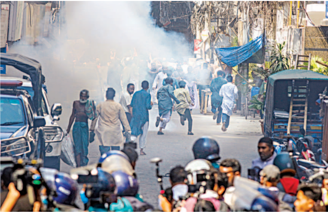
Police use teargas to disperse a procession of banned militant outfit Hizb ut-Tahrir in front of Baitul Mukarram Masjid in the capital after Juma prayers yesterday. Law enforcers detained several men from the spot.

Police recovered Tk 31,000 from the detainees, the OC said, adding that a case was filed in this connection.