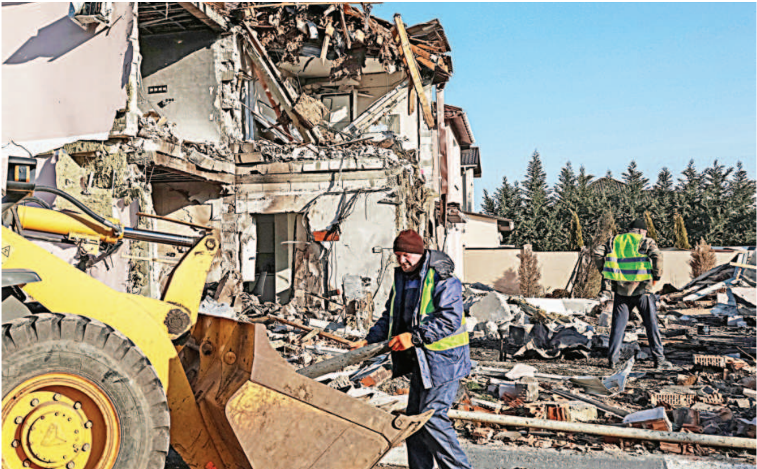
Municipal workers remove debris at the site of houses hit by a Russian drone strike in Odesa, Ukraine, yesterday. Russia staged night-time attacks on energy facilities in Odesa, cutting electricity to the Black Sea territory and leaving at least two dead.

REUTERS, Cairo Israel criticised a plan put forward by Arab states for Gaza’s reconstruction on Tuesday, while Palestinian group Hamas welcomed it. The White House said the plan adopted by Arab states did not address Gaza’s reality and that US President Donald Trump stood by his proposal. Meanwhile, Israel’s newly appointed military chief Eyal Zamir said yesterday that his country’s mission to defeat Hamas was not yet accomplished. Arab leaders adopted an Egyptian reconstruction plan for Gaza that would cost $53 billion and avoid displacing Palestinians from the enclave. Trump’s plan to displace Palestinians in a US takeover of the enclave received global condemnation last month.