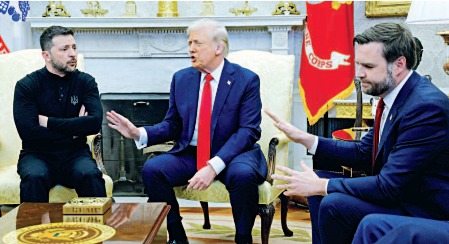
US President Donald Trump, along with Vice-President JD Vance, meets with Ukrainian President Volodymyr Zelensky at the White House in Washington, DC, US on February 28, 2025.

reconsider the US as a steady ally, the prospects for Ukraine remain as bleak as ever. Trump continues his divisive language, but as we have seen before, his actions are often divorced from his words. US relations with Russia have always enjoyed a rare bipartisan consensus, even during recent times, despite talks of aid cuts. But the current atmosphere seems to have upended the earlier equation—for now. After the fiery meeting that drew