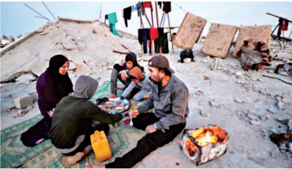
Israel blocked food and fuel from entering Gaza after the ceasefire's first phase expired on the night of March 1.

Palestine is at an immensely fragile position, where the ceasefire deal—a deal largely made by the US—could bring us back to square one. As widely known, the deal came in three stages: the first has advantages for both parties, and the second has more advantages for the Palestinians, in that it includes a more permanent withdrawal of Israeli troops and authorities' presence in Gaza, which they destroyed.