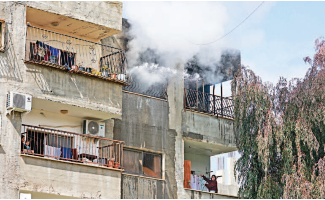
Smoke billows from an apartment targeted in an Israeli raid in the eastern neighbourhood of Jenin amid a weeks-long offensive in the occupied West Bank yesterday.

which she said could mobilise up to 800 billion euros ($840 billion). The EU is holding an emergency summit tomorrow. Meanwhile, Russia said yesterday that any normalisation of relations with the United States would require the lifting of sanctions against Moscow. “It is probably too early to say anything. We have not heard any official statements, but in any case, our attitude towards sanctions is well known, we consider them illegal,” Peskov said. “And, of course, if we talk about normalising bilateral relations, they need to be freed from this negative burden of so-called sanctions,” he added.