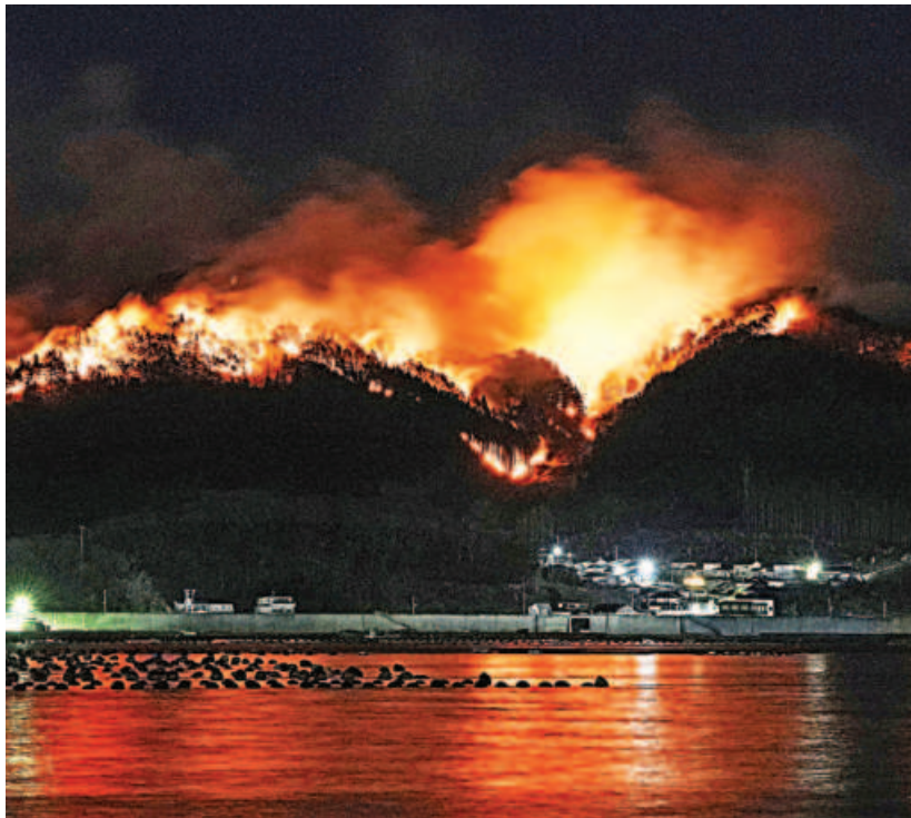
A wildfire continues to rage in a mountainous area in Ofunato, Iwate Prefecture, northeastern Japan, early yesterday. Firefighters were battling Japan's worst wildfire in half a century, which has left one dead and forced the evacuation of nearly 4,000 local residents.