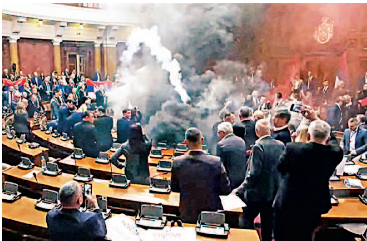
Serbian opposition lawmakers throw smoke grenades and tear gas inside parliament in Belgrade, Serbia, yesterday, as seen in this screengrab taken from a video. They were protesting against the government and supporting demonstrating students. During the chaos, one legislator suffered a stroke.

Israel's "closure of the Gaza Strip crossings for the third consecutive day, and its prevention of the entry of aid and goods, represents a Zionist insistence on violating the ceasefire agreement, and a clear war crime", Hamas said in its statement.