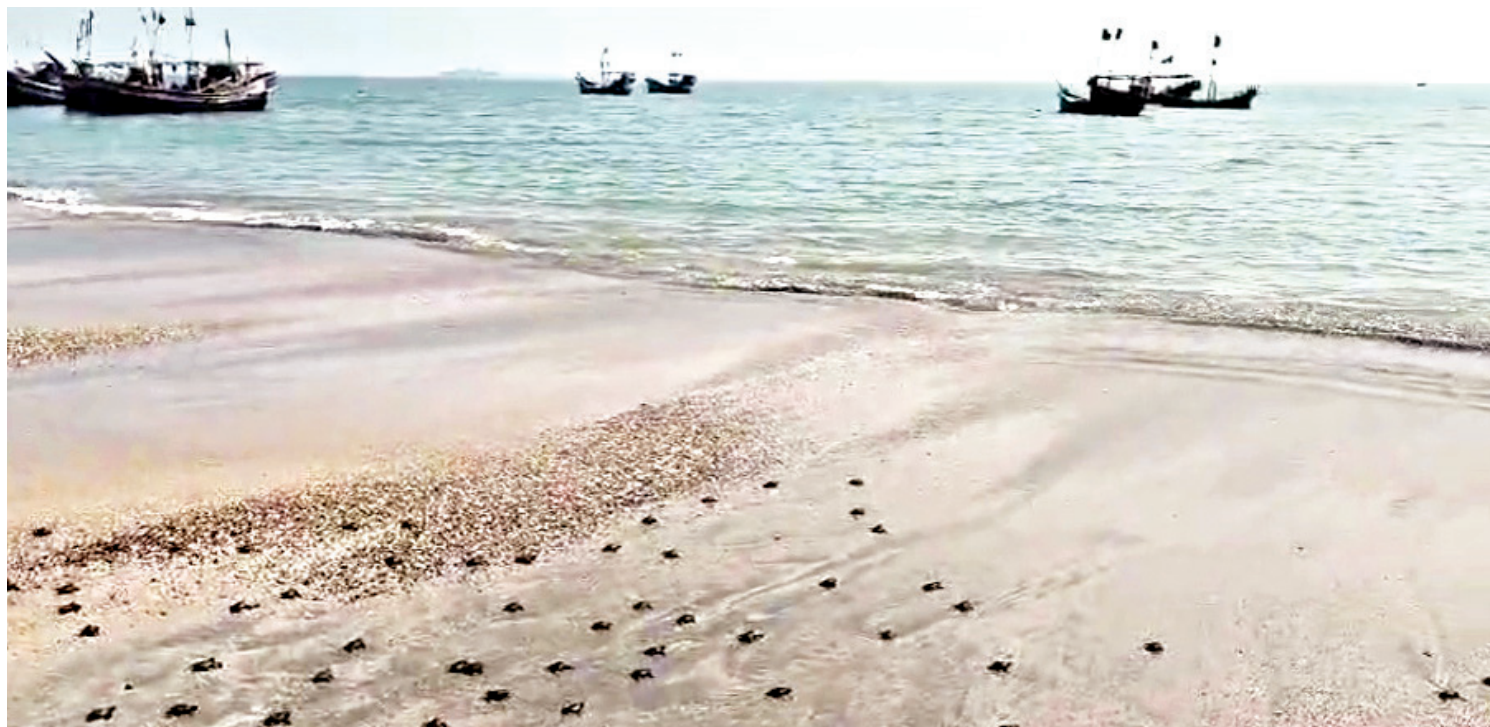
ST MARTIN'S ISLAND