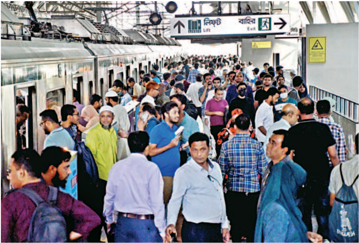
As office hours end and the time for iftar approaches, the capital’s metro stations get packed with commuters rushing to get home. The photo was taken at the Motijheel metro rail station yesterday afternoon.