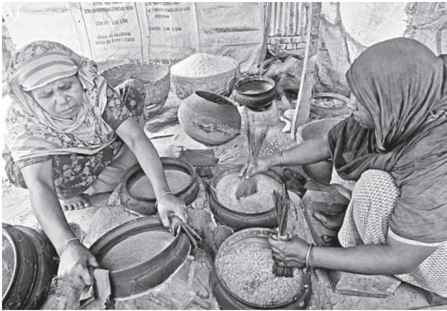
Two women fry puffed rice using hot sand and saltwater in a clay pot over an earthen stove. With high demand during Ramadan, they work from 3:00am to 8:00am, preparing several kilogrammes for sale in the market. The photo was taken at Bhorotkathi village in Jhalakathi yesterday.