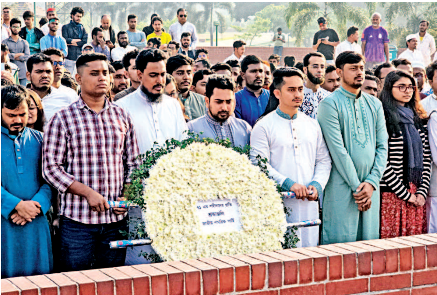
Leaders of National Citizen Party pay tribute to the martyrs of 1971 at the National Martyrs’ Memorial in Savar yesterday. The party said this was its first programme as a political party.