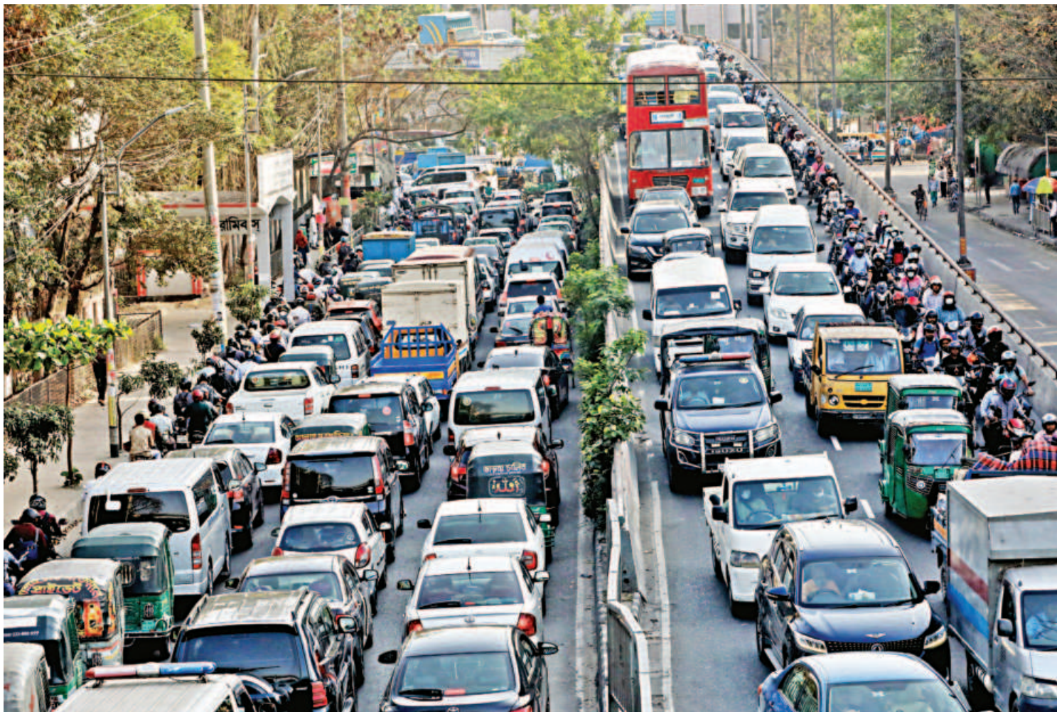
Heavy traffic congestion in Tejgaon yesterday, with long tailbacks on both sides of the road. Despite adjusted office hours for Ramadan, the capital's roads remain crowded during the pre-iftar rush.