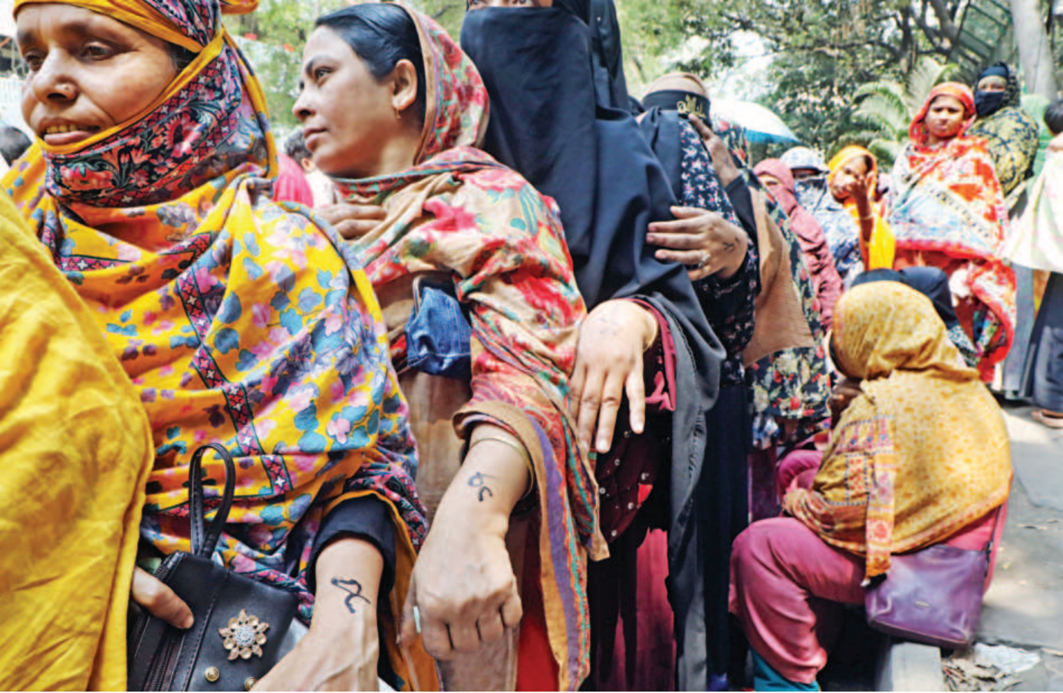
To maintain order and ensure a systematic sale of essential goods, buyers who arrived to purchase TCB products were assigned numbers by the truck sale authorities. The photo was taken from the Katabon area in Dhaka yesterday.