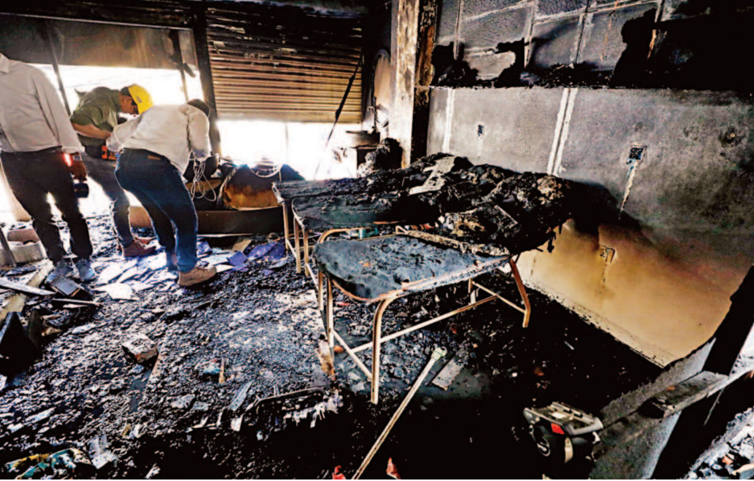
Firefighters inspect the charred remains inside a building in the capital's Shahjadpur area. A fire started on the first floor on the six-storey building around 12:31pm yesterday, killing four people. Two units of Baridhara Fire Station brought the blaze under control at 1:04pm. Officials said the fire originated from a beauty parlour.