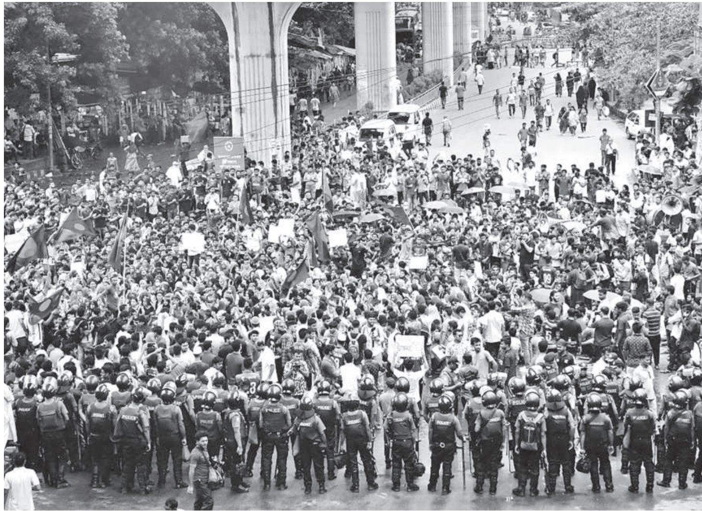
Protesters face off against police in Shahbag, Dhaka during the quota reform movement on July 5, 2024.

Now, the interim government has formed commissions to recommend reforms to key sectors including the electoral system,