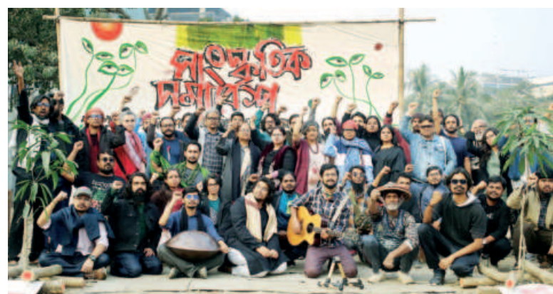
Citizens stand in solidarity during a cultural programme organised by the Bangladesh Tree Protection Movement on the 30th day of the sit-in protest.