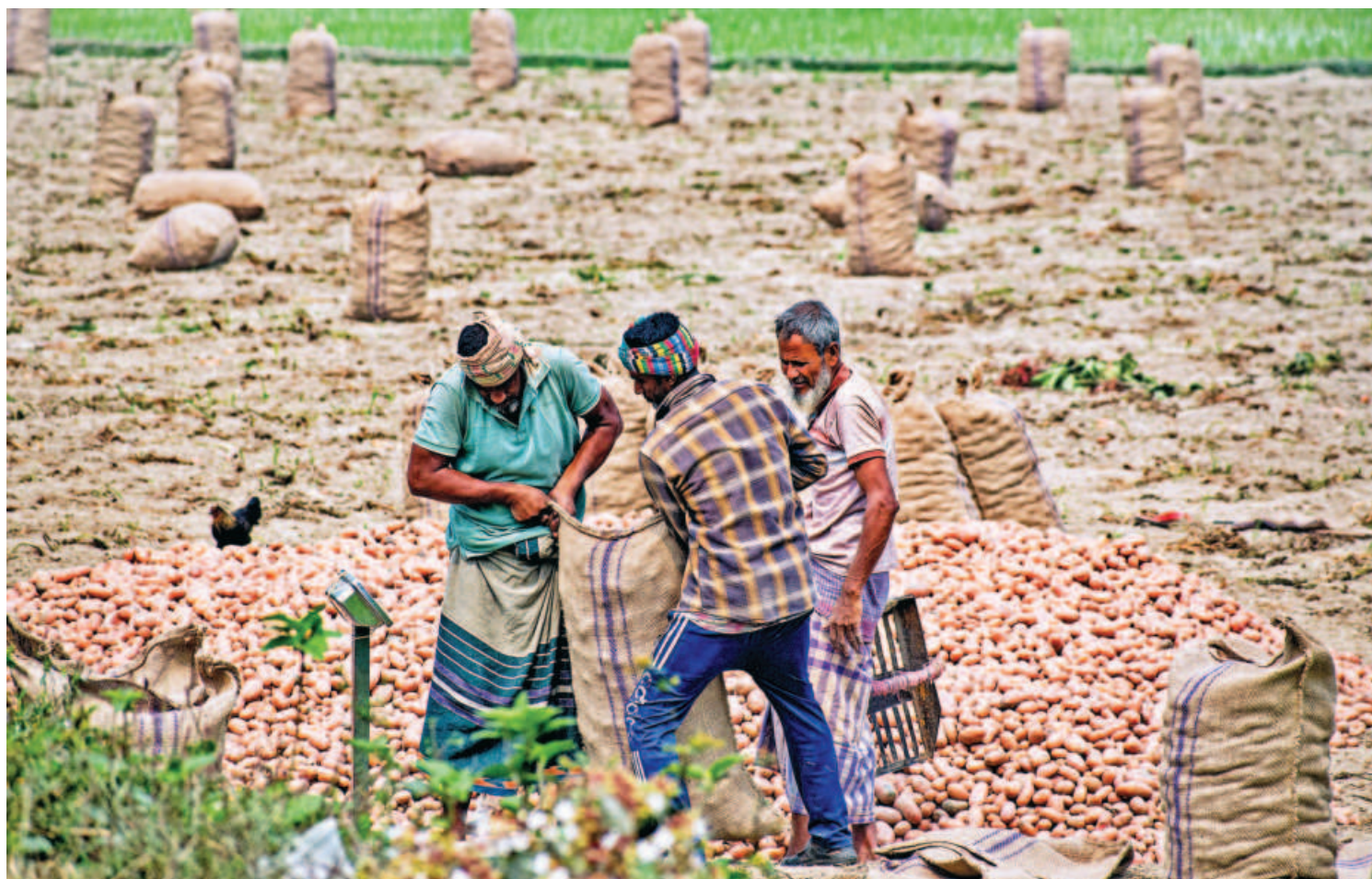
North Bengal potato farmers have harvested over half of their crops but are facing financial hardship. Despite a significant increase in cultivation area this year, wholesale potato prices are barely covering production costs. Currently, a maund of potatoes sells for Tk 600-620, while production costs, according to a local agricultural office, are around Tk 600 per maund. The photo was taken recently in Bogura's Shibganj upazila.