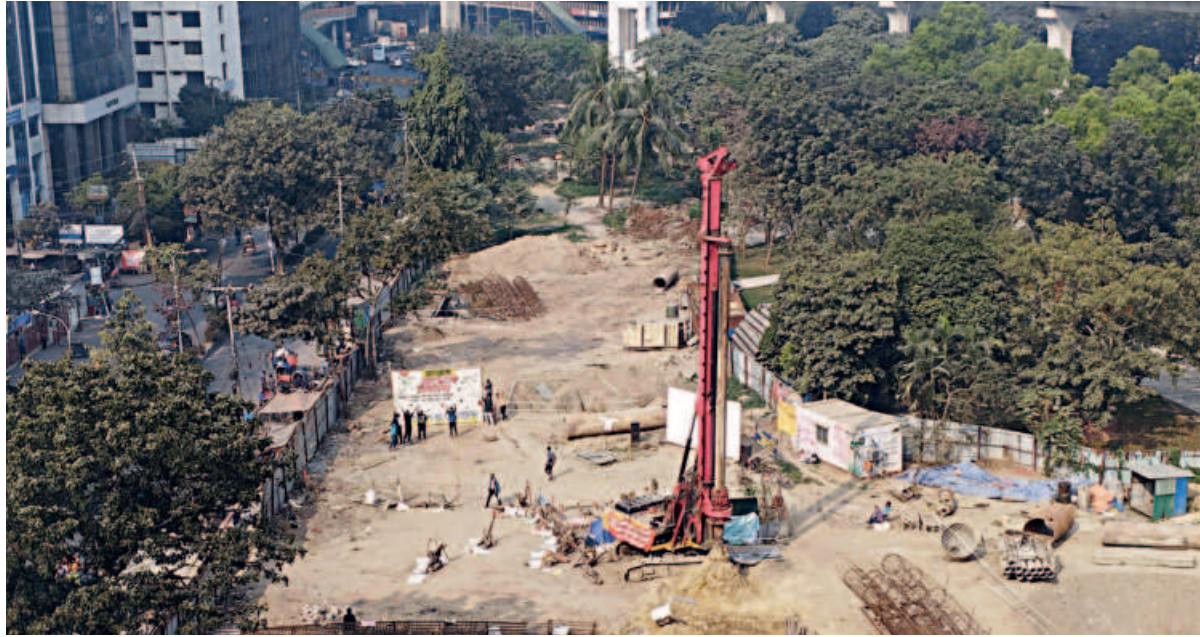
For the past 78 days, Bangladesh Tree Protection Movement protesters have been staging a sit-in at Panthokunjo Park.

Access to ecosystem services aligns with Sustainable Development Goals