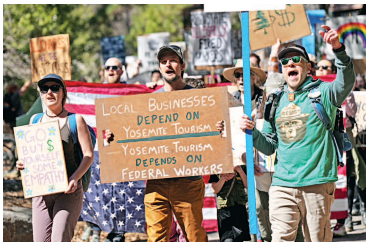
Protesters march in Yosemite National Park during a demonstration against the mass firings of National Park Service employees by the Trump administration in Yosemite Valley, California, US, on Saturday.