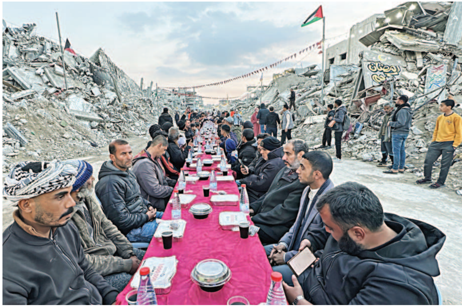
Palestinians gather for a communal iftar on the first day of the Muslim holy month of Ramadan, amid rubbles of destroyed buildings in Rafah in the southern Gaza Strip on Saturday.

"The image of the police has been tainted because