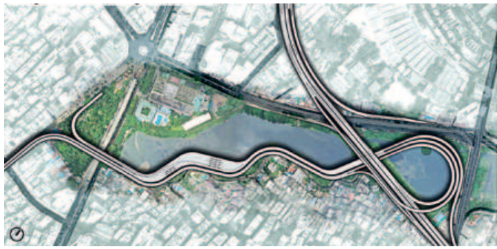
The composite image shows Panthokunjo in April 2016 at the top, the park in 2025 in the middle, and a layout of the Moghbazaar Intersection at Panthokunjo at the bottom.

It is time to question why citizen movements advocating for the protection of ecosystem services have failed to translate into concrete policies that put an end to the government's and its development partners' alienating practices.