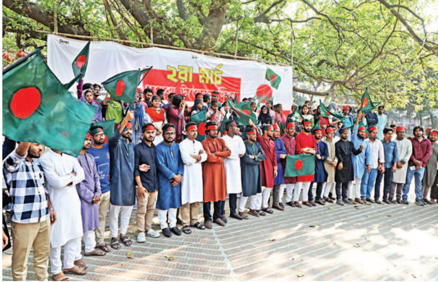
Members of newly-formed Gonotantrik Chhatra Sangsad, led by former leaders of the Students Against Discrimination, observe Flag Hoisting Day on the Dhaka University campus yesterday. On this day in 1971, the first Bangladesh flag was hoisted at DU, marking a significant step in the movement for independence.