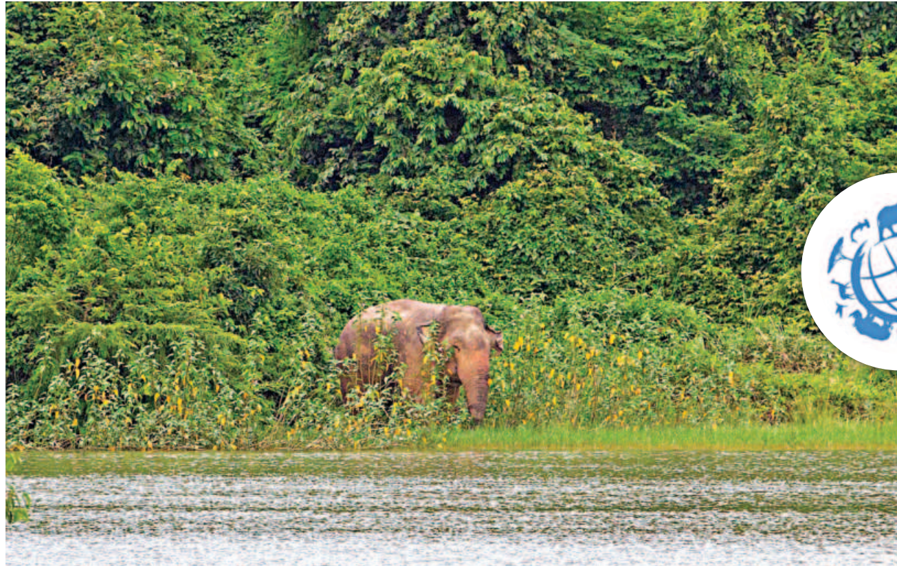
An elephant grazing freely in the eco-friendly KEPZ in Chattogram's Anowara, where human-elephant conflict issues have lessened recently. Without further conservation efforts, Bangladesh may no longer be one of the 13 Asian countries with wild elephants within the next decade, experts warn.

Ahmed insisted that the ministry allocates the respective budget to Shilpakala first although the second paragraph of the letter mentioned that the RELATED STORY ON PAGE 6 SEE PAGE II COL 1