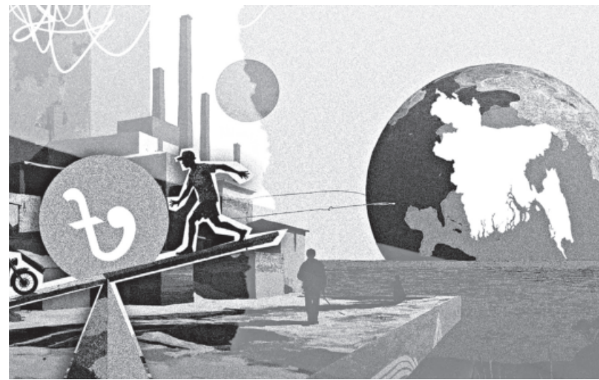
VISUAL: SALMAN SAKIB SHAHRYAR

Compounding these structural weaknesses are persistent governance challenges and institutional deficiencies. Corruption, crony capitalism, lack of transparency in public policy, and political instability have undermined effective economic