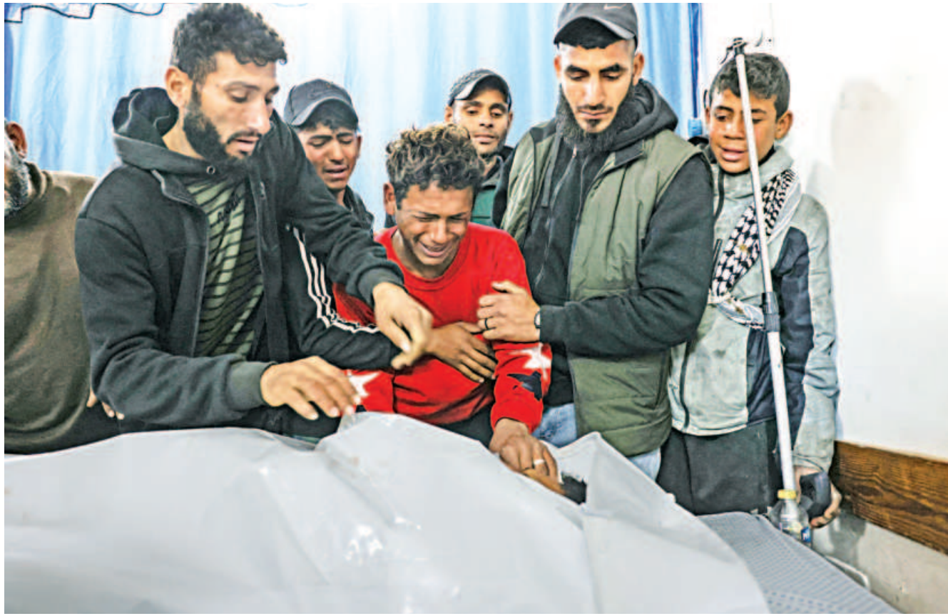
A young man bids farewell to one of two Palestinians killed in an Israeli strike in Beit Hanun, in the northern Gaza Strip, yesterday. The International Committee of the Red Cross called on Israel and Hamas to maintain their ceasefire in Gaza to prevent the conflict-weary region from sinking back into despair.