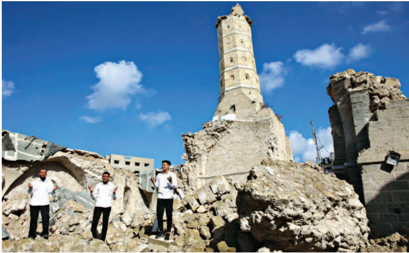
Muslim worshippers pray amidst the rubble and ruins in a destroyed part of Gaza City's historic Omari Mosque on the first day of the holy fasting month of Ramadan yesterday.

Speaking to Fox News after the tense White House meeting, Zelensky conceded it would be “difficult” for Ukraine to hold off invading Russian forces without US support.