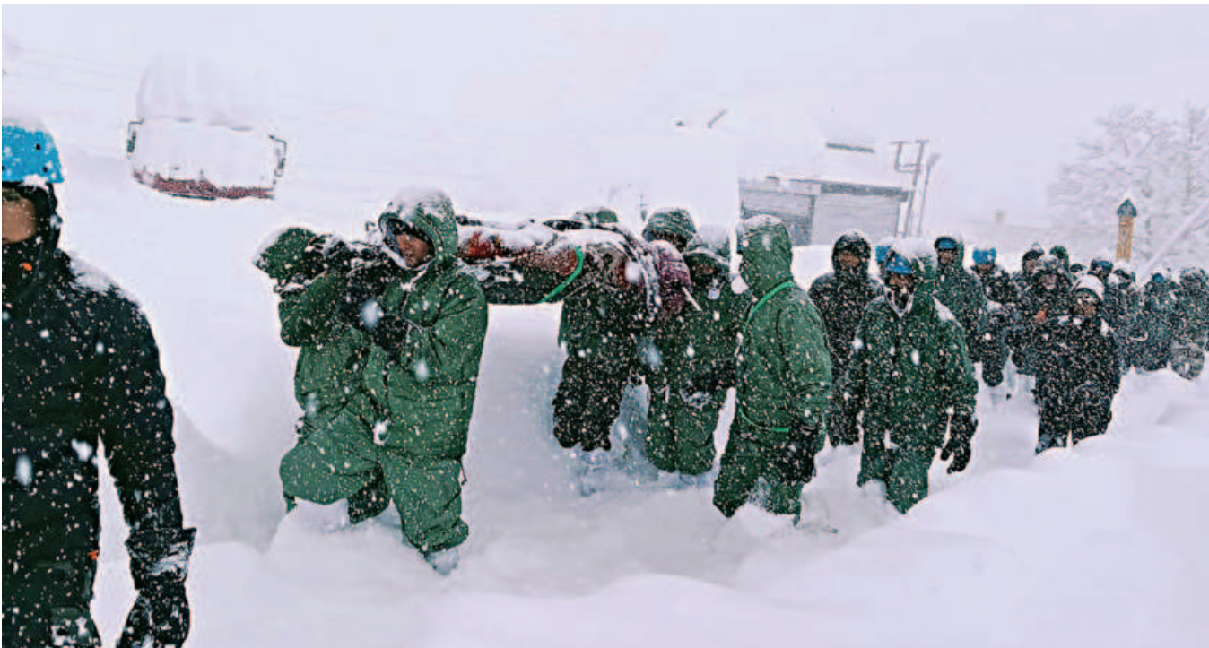
In this handout photo taken and released yesterday by the Indian State Disaster Response Force, rescuers carry Border Roads Organisation workers after an avalanche near Mana village in the Chamoli district of Uttarakhand state. Over 40 construction workers were missing, while 15 others were rescued after the avalanche in the Himalayan state following heavy snowfall.