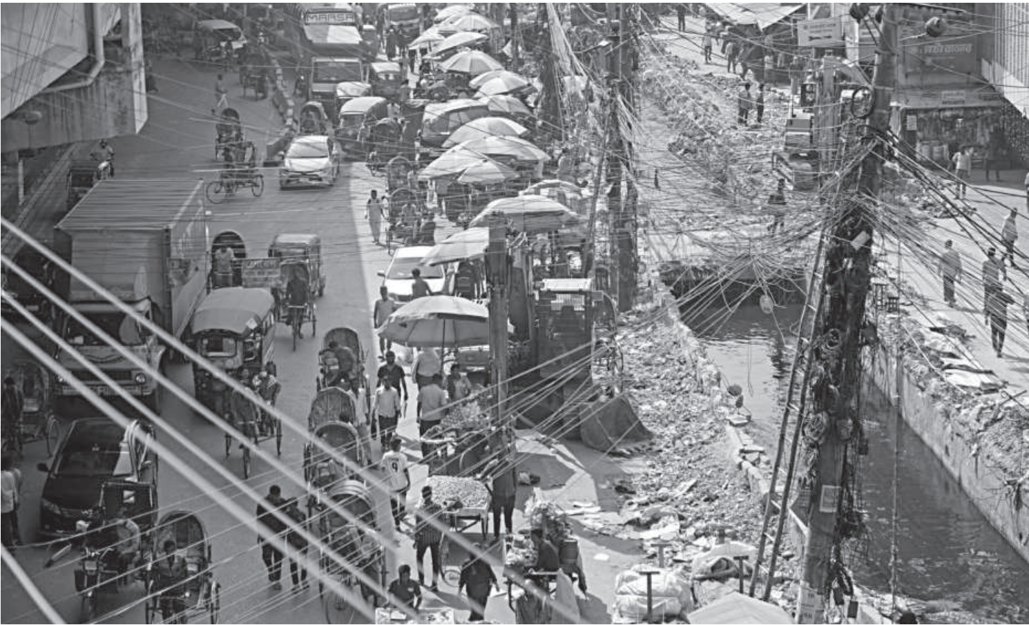
Many of the roads in the busy Bahaddarhat area in the port city remains under the clutches of vendors. Ongoing development work further complicates the situation. These factors together contribute to traffic congestion, making it difficult for residents to navigate the area. The photo was taken recently.