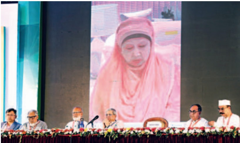
BNP Chairperson Khaleda Zia reading out a statement before the party's extended meeting at the ground adjacent to LD Hall of the parliament yesterday. Khaleda addressed the event virtually and a chair was left empty on the stage out of respect for her.

She called upon her party activists to unite and re-organise the BNP with greater determination, incorporating the people, so that the party can once