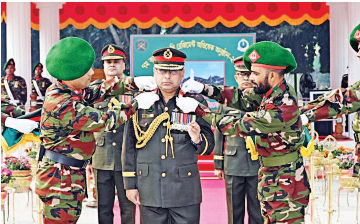
Army chief Gen Waker-Uz-Zaman being inducted as the "Colonel of the Regiment" of the Bangladesh Infantry Regiment at Rajshahi Cantonment yesterday.