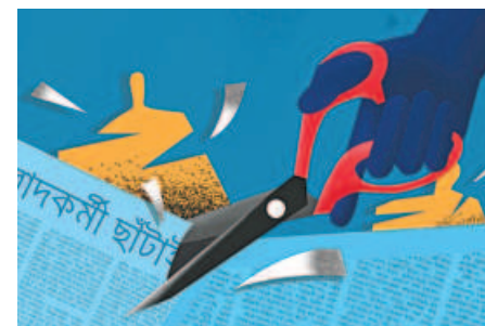
ILLUSTRATION: NOOR US SAFA ANIK

KA: The wage board is not within the remit of this commission, so we will not discuss it. However, we found a dominant view among working journalists outside Dhaka that they are not benefiting from the wage board. In fact, some owners falsify records to claim they are implementing the wage board, even though they are not. These owners also manipulate circulation figures to receive higher advertising rates. As a result, owners benefit, while only a few journalists see any advantage from the wage board.