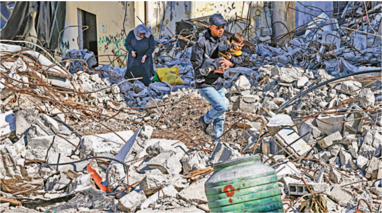
People walk on building rubble at the Nur Shams camp for Palestinian refugees near Tulkarem, where Israeli forces allowed residents to retrieve belongings after reportedly issuing demolition notifications for several houses amid a weeks-long offensive in the occupied West Bank yesterday. The head of the UNRWA said more than 50 people, including children, have been reported killed since the Israeli forces’ operation started.