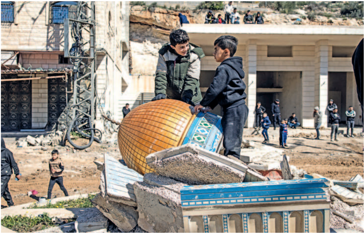
Two Palestinian boys sit atop a broken sculpture of Jerusalem's Dome of the Rock shrine that was destroyed by Israeli forces during a military raid in Qabatiya, in the north of the occupied West Bank, yesterday.