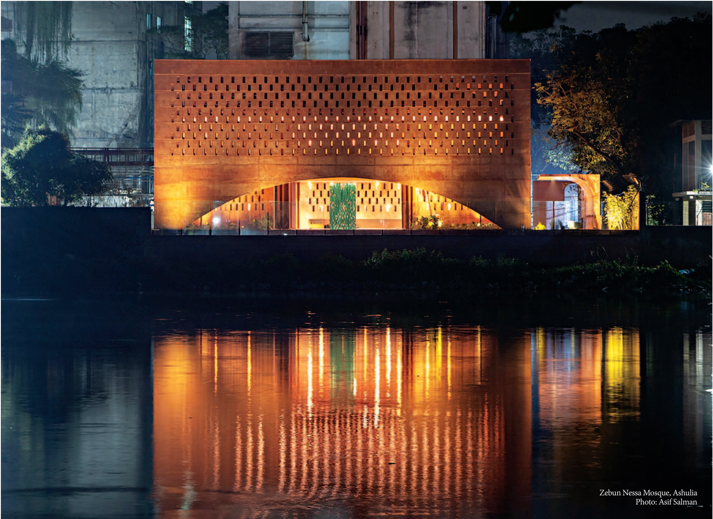
Zebun Nessa Mosque, Ashulia