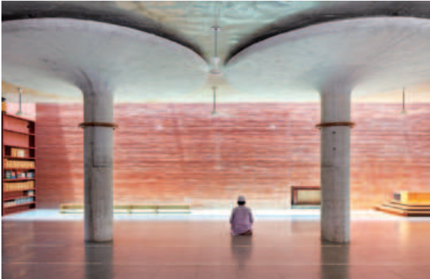
Mayor Mohammad Hanif Jame Mosque, Azimpur