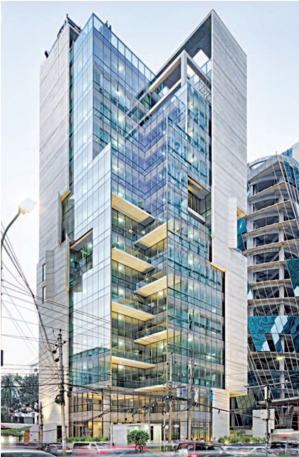
Simpletree Lighthouse, Banani.