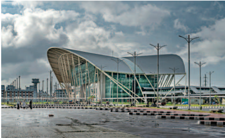
Cox's Bazar Railway Station.