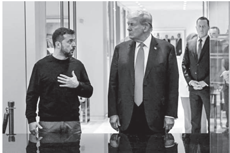
President Donald Trump’s proposed plan involves scooping up $500 billion worth of REEs for Ukraine for the US in exchange for brokering a peace deal between Ukraine and Russia.

Trump’s Greenland bid is also about strengthening a strategic military base. The existing US Pituffik Space Base—previously known as Thule Air Base until early 2023—is vital for US military operations in the Arctic, and expanding US influence there would help counteract Russian ambitions. With its