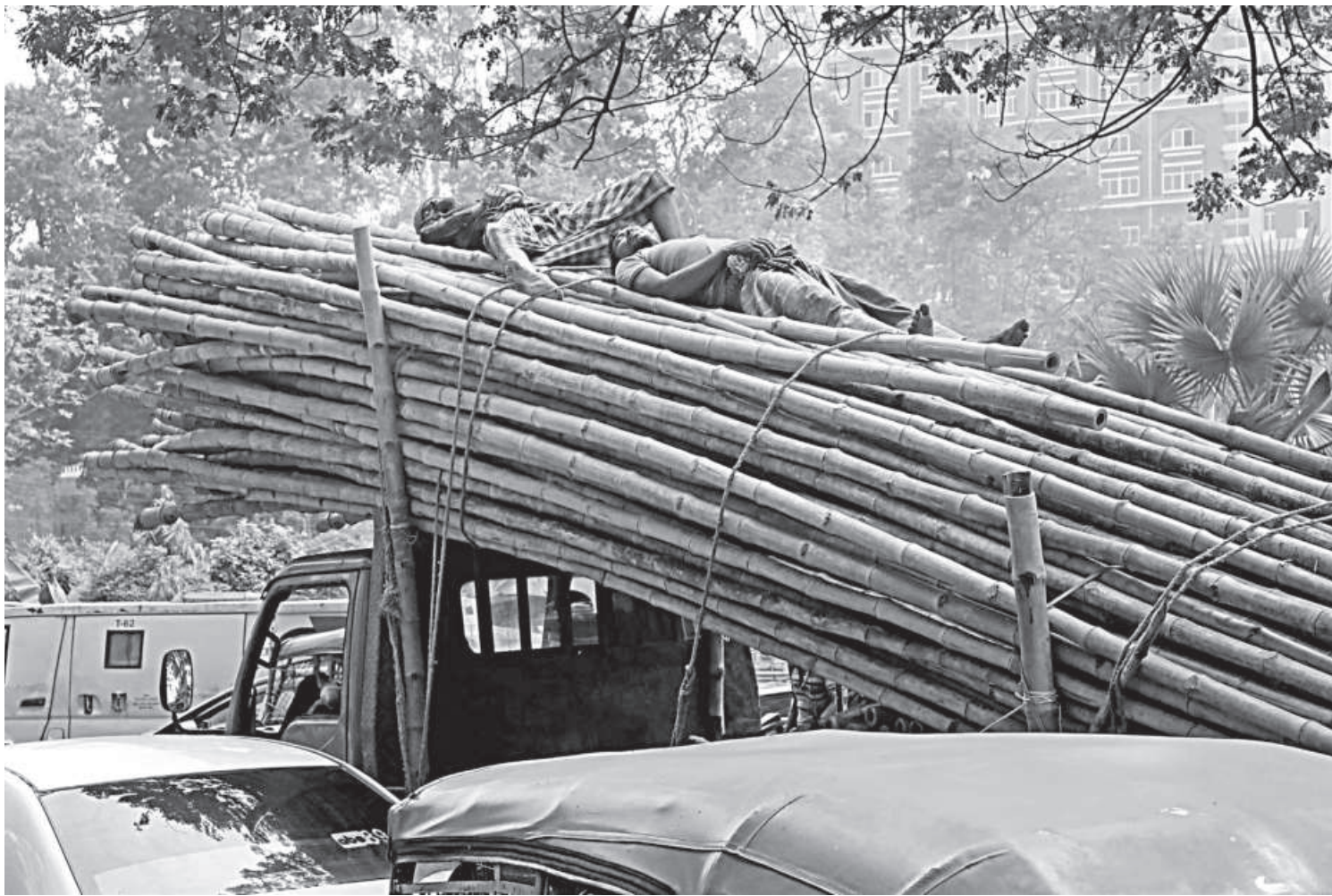
Two workers lay asleep atop this pile of bamboo which has been tied on top of a moving pickup truck. Such disregard for safety measures could lead to an accident at any moment. The photo was taken from Doyel Chattar yesterday.