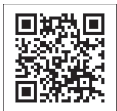
Scan the QR code for footage of Gono Bhaban.

Her rooms still contain pages upon pages of reports on her party members, and government employees (including a glowing report of a former intelligence agency chief who is currently being prosecuted by the ICT). A full list of the candidates that passed the written tests of the 32th Bangladesh Civil Service exams was found, along with the admit cards of