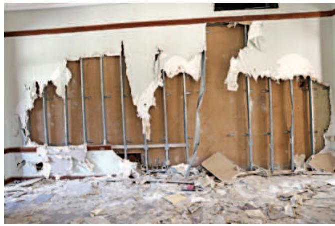
Once a central command of Sheikh Hasina's brutal dictatorship, the post-August Gono Bhaban, above, is now all but in ruins. Below are some documents that offer, among other things, insights into how her government sought to keep citizens under surveillance.