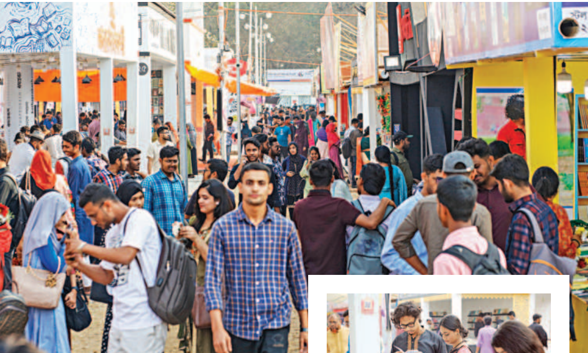
With only nine days remaining until the Ekushey Boi Mela concludes, book enthusiasts flock to the fair to satisfy their literary appetites. Booklovers were seen eagerly exploring the diverse range of books available at the Suhrawardy Udyan.