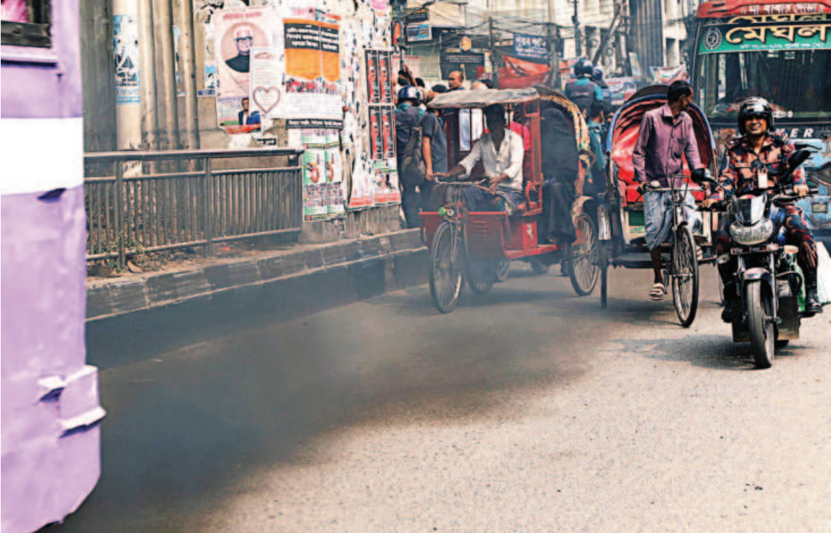
A bus exhausts black smoke directly at the vehicles behind it, polluting the environment and harming the health of passersby. In recent times, the removal of such buses from Dhaka's streets have become a pressing issue. The photo was taken in Purana Paltan yesterday.