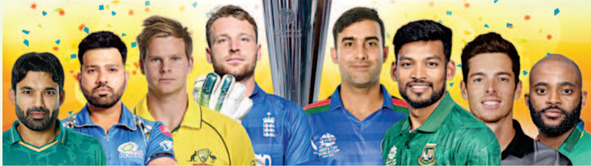
ILLUSTRATION: ANWAR SOHEL