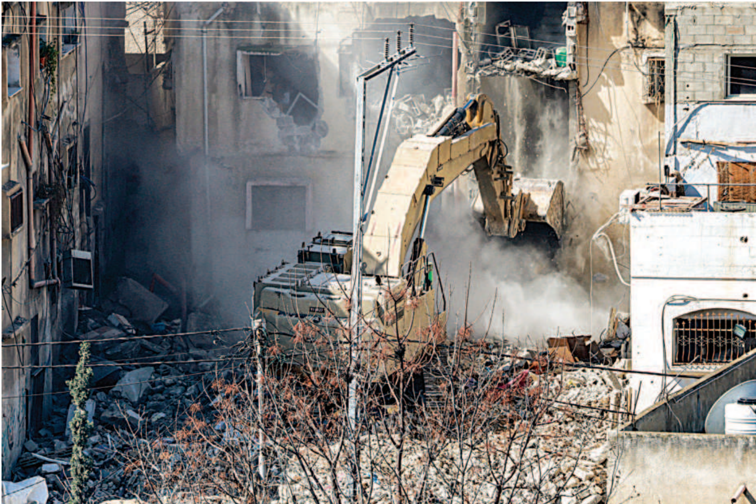
An Israeli army excavator demolishes a residential building in the Tulkarem camp for Palestinian refugees during an ongoing Israeli military operation in the occupied West Bank yesterday.

AFP, Jerusalem Israeli Defence Minister Israel Katz yesterday confirmed that troops remain at five positions in southern Lebanon past a pullout deadline, vowing action against any Hezbollah violation,” said Katz in a statement shortly after an extended deadline expired for Israel to withdraw from Lebanon under the November 27