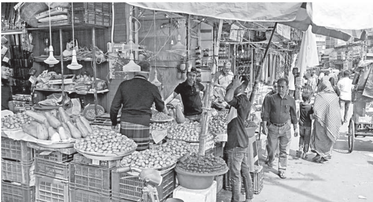
Pedestrians are forced to walk on the road as vendors have completely occupied the footpath along Clay Road at the Dakbanga intersection in Khulna. In many parts of the city, footpaths are being used for fruit stalls and grocery shops, creating constant inconvenience for people. The photo was taken yesterday.

The two-day drive was conducted as part of the first phase of the project.