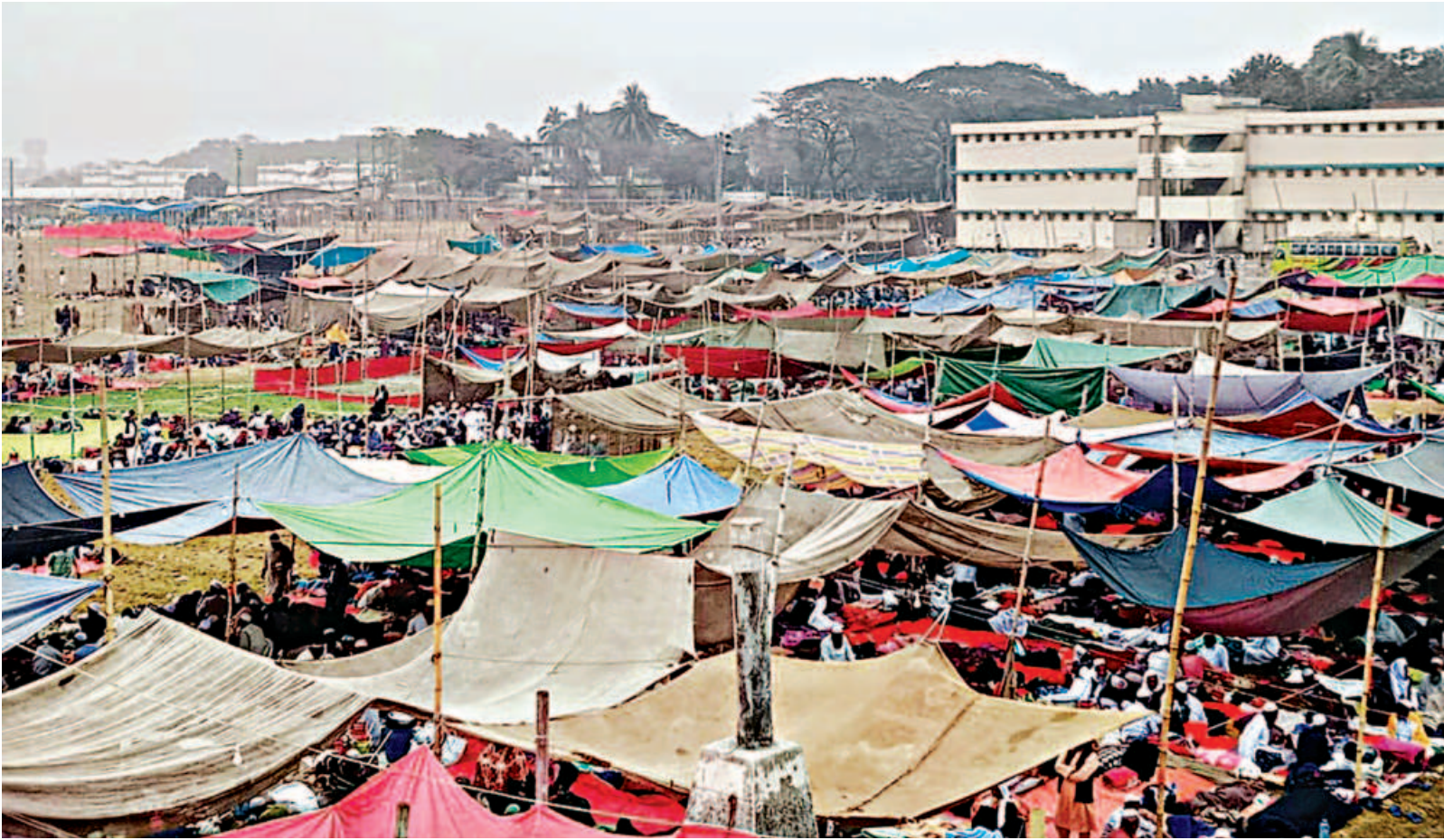
Tents have been set up on the Biswa Ijtema ground on the bank of the Turag in Tongi as devotees from home and abroad start gathering there to join the second phase of three-day Biswa Ijtema, one of the largest congregations of Muslims, that begins today. The photo was taken around 4:00pm yesterday.