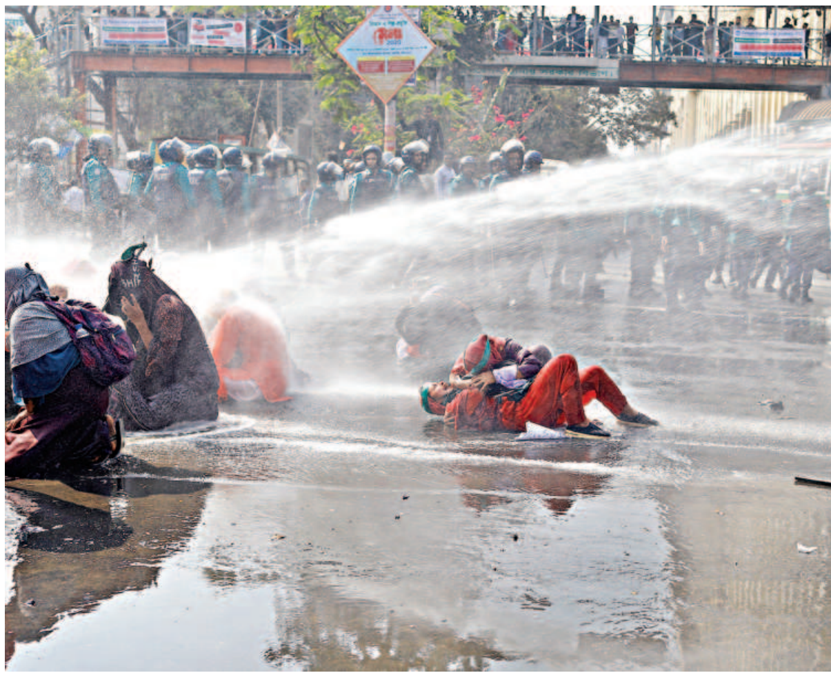
Left , a woman falls on the ground as police shoot water from a cannon while another tries to protect her during a sit-in at Shahbagh yesterday. Police used batons and water cannons to disperse the protesters, top right , demanding reinstatement of their appointment as assistant teachers in government primary schools. Bottom right , police charged batons to disperse sacked police officials, who were dismissed during the Awami League government, in front of the Secretariat.