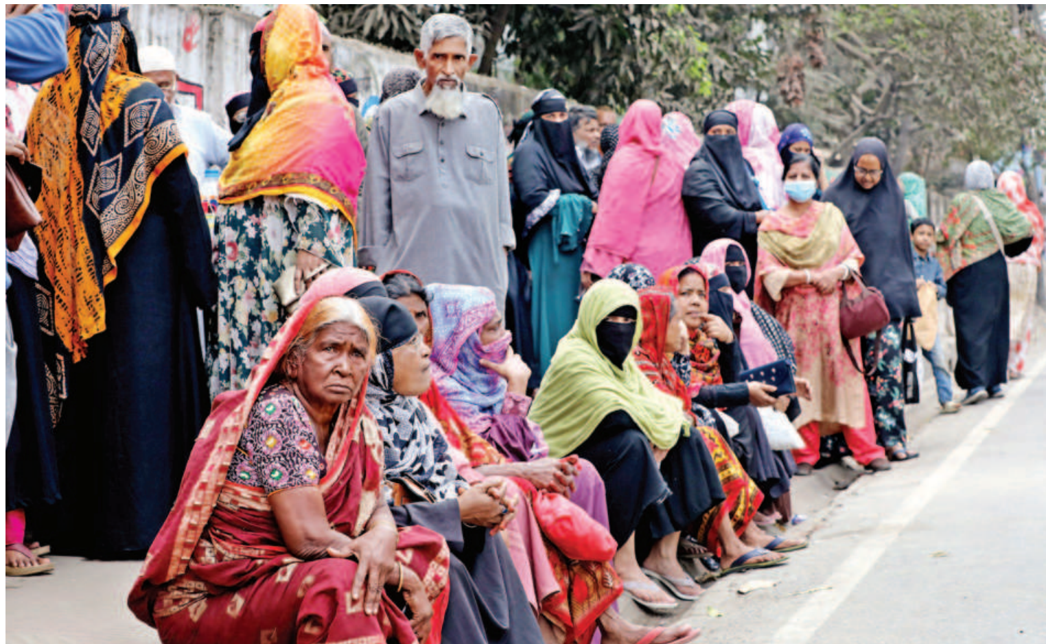
A group of women anxiously wait on the footpath for a TCB truck to arrive. They had been there since 8:00am, but by noon, there was still no sign of the truck. Many had also waited in vain the previous day, losing valuable work hours. With soaring market prices, these low-income individuals have no choice but to endure long waits to buy essentials from TCB trucks at subsidised prices. The photo was taken near Mohammadpur Bus Stand in the capital yesterday.

On Tuesday, 1,775 people were arrested, including 607 as part of the operation. On Monday, 1,521 individuals were arrested, with 343 apprehended as part of the operation. On Sunday, 1,308 arrests were reported, but the PHQ did not provide a breakdown of the arrests.