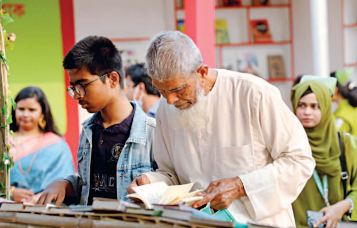
A young boy and an elderly stand side-by-side as they browse through the variety of books available at a stall at Suhrawardy Udyan yesterday. Every year, Ekushey Boi Mela brings together people from all walks of life to enjoy the one hobby they all share -- the love for books.