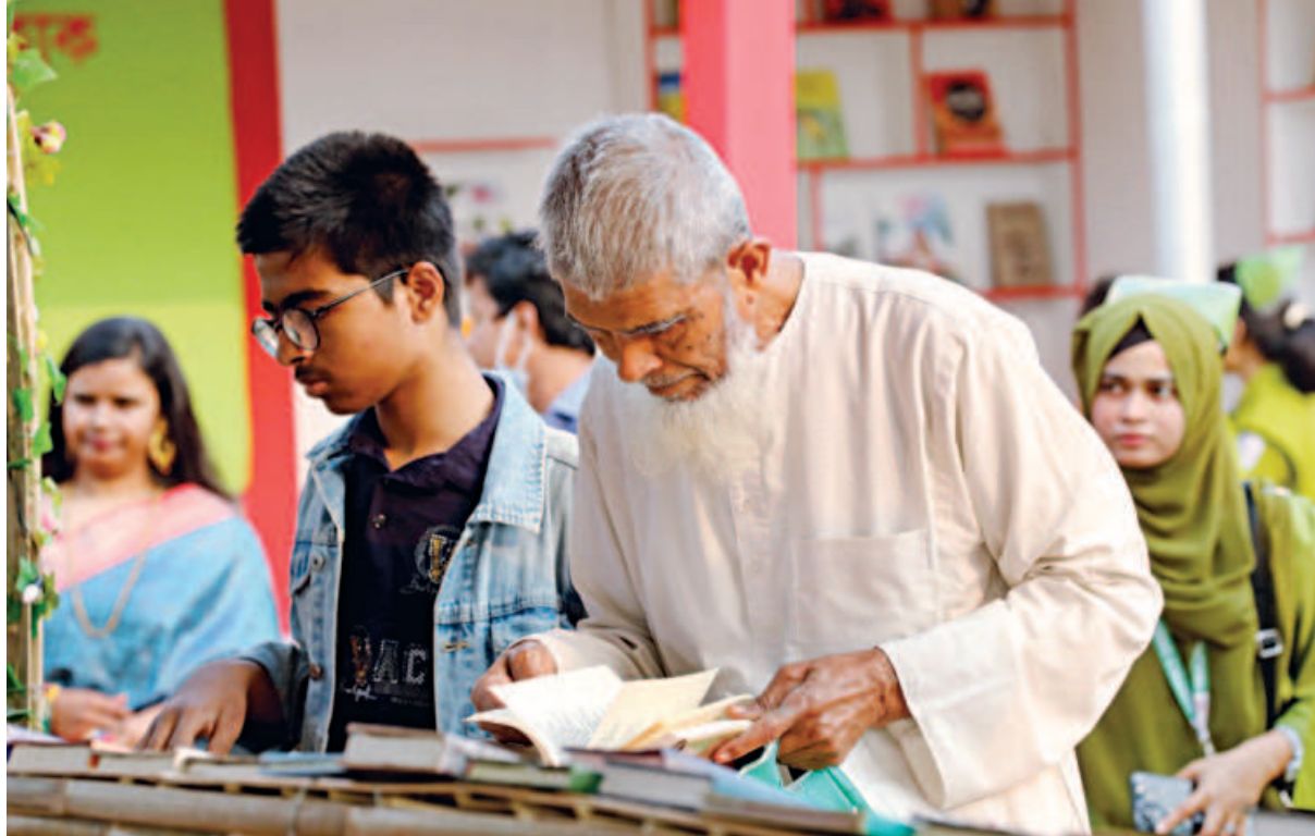
A young boy and an elderly stand side-by-side as they browse through the variety of books available at a stall at Suhrawardy Udyan yesterday. Every year, Ekushey Boi Mela brings together people from all walks of life to enjoy the one hobby they all share -- the love for books.