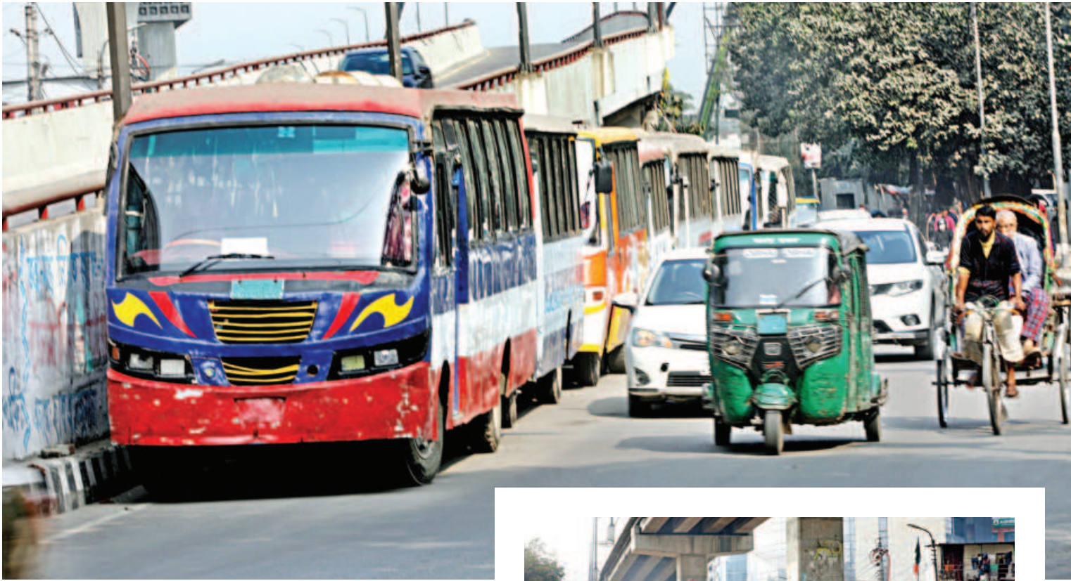
Buses, minibuses, and trucks are parked daily along the flyover on the Karwan Bazar-FDC road, narrowing the passage and disrupting traffic flow. These buses primarily transport employees of various government and private organisations, remaining parked from morning till afternoon after dropping off passengers. The photo was taken recently.