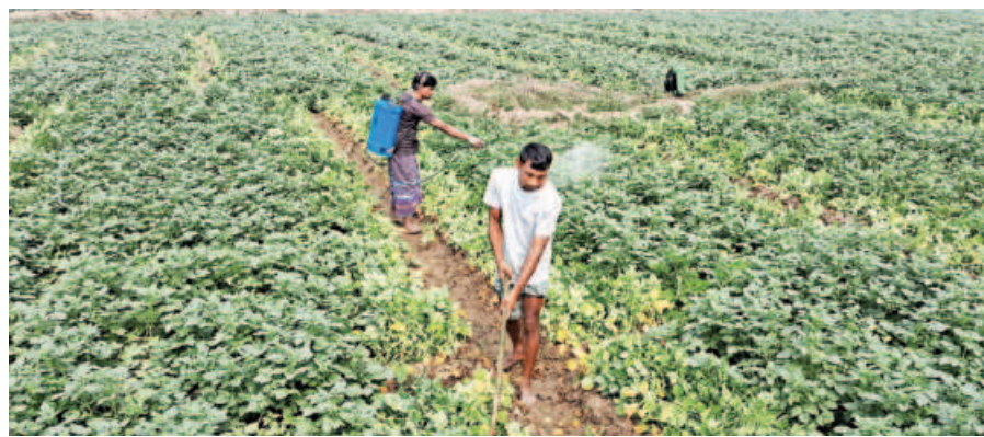
Farmers spray pesticide at a potato field in an attempt to save the remaining plants from late blight disease. The photo was taken from Barunagaon village in Thakurgaon Sadar upazila.

OUR CORRESPONDENT, Thakurgaon Potato growers in Thakurgaon and Panchagarh are struggling to protect their crops as cold weather and dense fog have triggered an outbreak of late blight disease this year. The fungal disease, locally known as Patamora rog, is spreading very fast, causing deep concern among local farmers about possible financial losses. High price of fungicides, needed to control the outbreak, is further increasing the production cost. Thakurgaon Department of