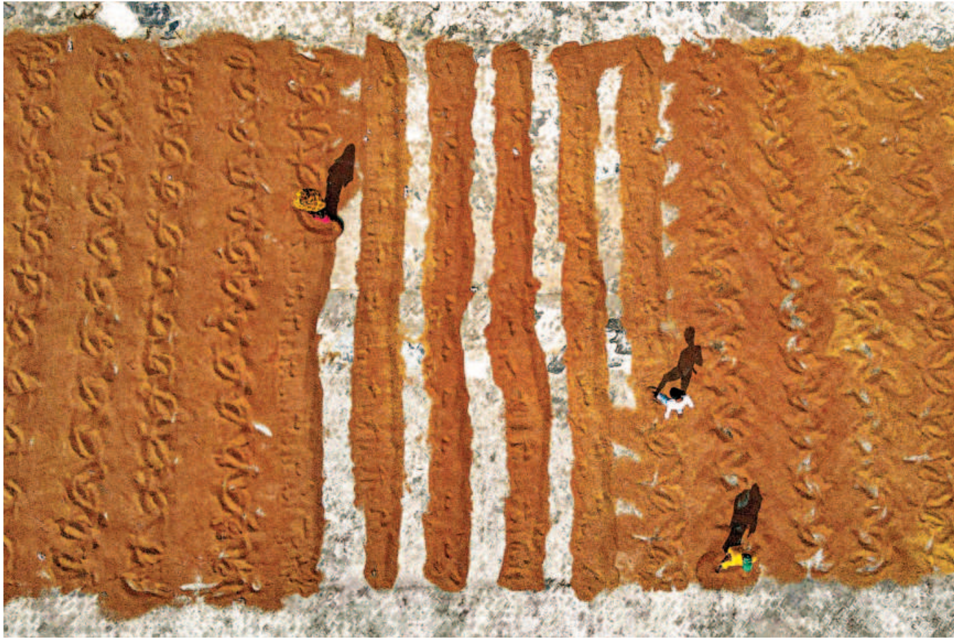
Workers sun drying recently harvested Aman paddy on a concrete surface in Khulna city's Gallamari. Sun drying is an eco-friendly and traditional drying method for reducing the moisture content of paddy. After drying, each worker gets Tk 10-12 per maund of paddy dried. They can process around 250-300 maunds at a time. The photo was taken recently.