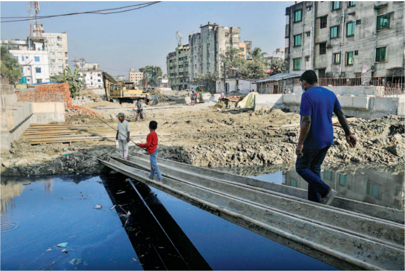
People walking on steel girders to cross over an unfinished canal at Bahaddarhat's Baraipara in Chattogram city yesterday. The project to construct this new 2.9km canal, which is supposed to lead to Karnaphuli river, was taken up in 2014 by the Chattogram City Corporation. Eleven years on, only 2km of earth has been excavated.