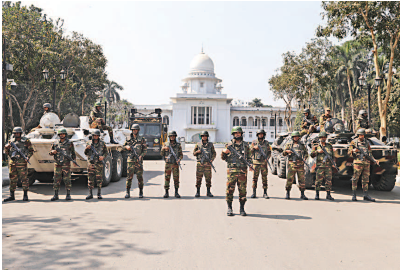
Army personnel stand guard in front of the Supreme Court yesterday. Security at the SC has been heightened as part of precautionary measures in light of the ongoing situation in the country.