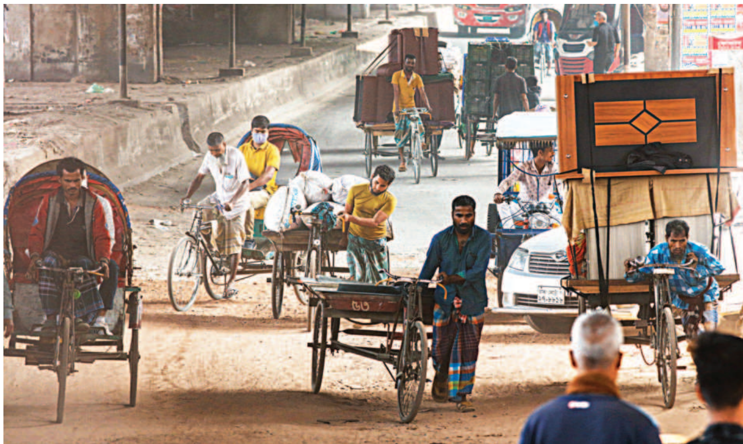
Vehicles find it difficult to navigate the eroded road beneath the Mayor Hanif flyover in the Sayedabad area. Neglect and a lack of repairs have worn the road down to the point where the underlying bricks are now exposed. This deterioration has led to increased dust pollution and traffic congestion, adversely affecting the daily lives of pedestrians and commuters. The photo was taken recently.