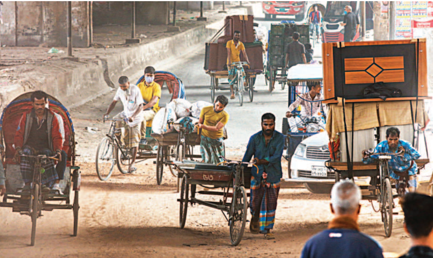
Vehicles find it difficult to navigate the eroded road beneath the Mayor Hanif flyover in the Sayedabad area. Neglect and a lack of repairs have worn the road down to the point where the underlying bricks are now exposed. This deterioration has led to increased dust pollution and traffic congestion, adversely affecting the daily lives of pedestrians and commuters. The photo was taken recently.