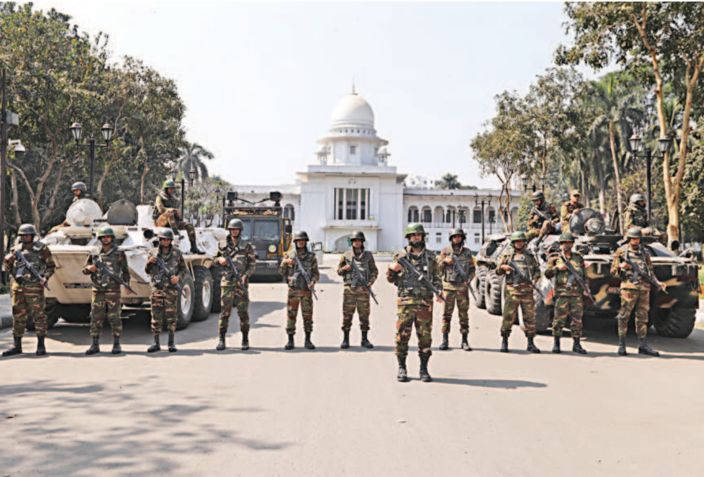
Army personnel stand guard in front of the Supreme Court yesterday. Security at the SC has been heightened as part of precautionary measures in light of the ongoing situation in the country.

অনলাইনের মাধ্যমে পূবালী ব্যাংকের সকল শাখা এবং উপশাখা হতে ইসলামী ব্যাংকিং সেবা প্রদান করা হয় (কেবলমাত্র জমা ও উত্তোলন)