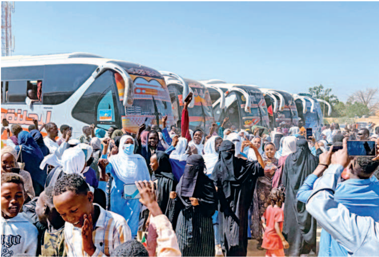
People displaced by the ongoing war in Sudan return to Wad Madani in the Jazira state yesterday after the city was retaken by the Sudanese army from the Rapid Support Forces (RSF) paramilitaries.

AFP, Kyiv Ukraine said yesterday it had captured more than 900 Russian troops over six months of fighting in the western Russian Kursk region. Kyiv says a key goal of its struggling operation launched in August just over its border with Russia was to build up reserves of Russian soldiers to exchange for Ukrainian prisoners of war. “During the operation, Ukrainian forces captured 909 Russian servicemen, significantly replenishing the exchange fund,” the Ukrainian military said in a statement. “This made it possible to bring home hundreds of Ukrainian defenders who had been held in Russian prisons,” it added. Kyiv and Moscow still cooperate on prisoner exchanges despite being at war for nearly three years, and Ukraine has made returning its captured troops a priority. Last year, the Ukrainian military said its forces had captured more than 700 Russian troops during operations in the