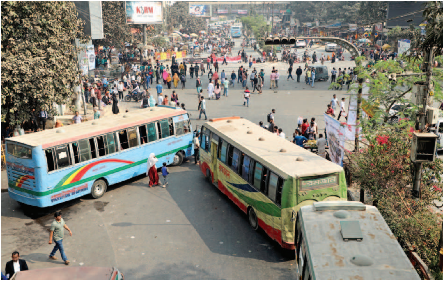
Family members of the martyrs of the July uprising staged a blockade at Shahbagh around 11:00am yesterday. They demanded official recognition of the martyrs, compensation for their families, and swift legal action against those behind the murders. The blockade, which caused immense sufferings to commuters and pedestrians, was called off around 6:00pm.