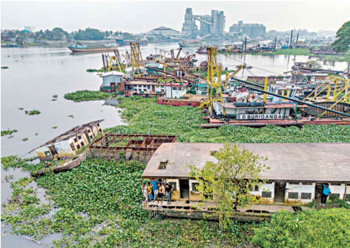
Dredgers, survey, support, and utility vessels rusting away on the Shitalakkhya near Hajiganj Ferry Ghat in Narayanganj. Some of them are about to sink and some have been beached. Several teens were seen hanging around on the vessels. The photo was taken recently.