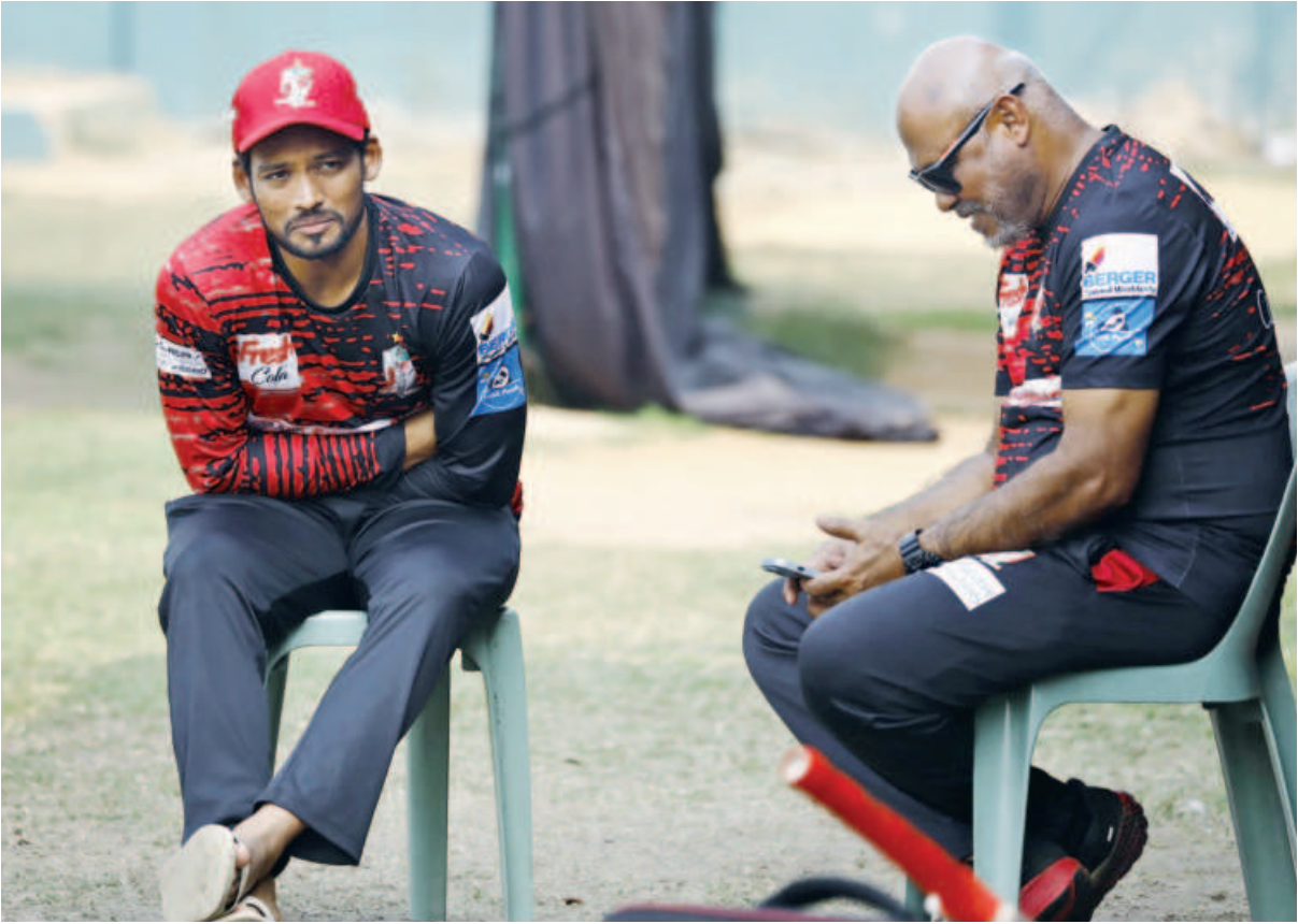
Bangladesh skipper Najmul Hossain Shanto sitting adjacent to Fortune Barishal head coach Mizanur Rahman Babul, who hinted yesterday that Shanto is unlikely play a part in the Bangladesh Premier League final at the Sher-e-Bangla National Cricket Stadium on Friday. An out-of-form Shanto played five matches for the defending champions in the initial phase of the tournament before being dropped from the playing eleven.