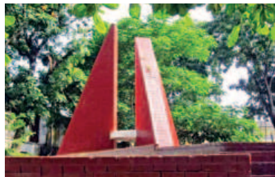
Rangpur Central Shaheed Minar

At that time, Rangpur's intelligence officers suggested the district judge file a case. He, however, chose to advise the police against using harsh measures on the students. He recommended waiting for the situation to calm down.