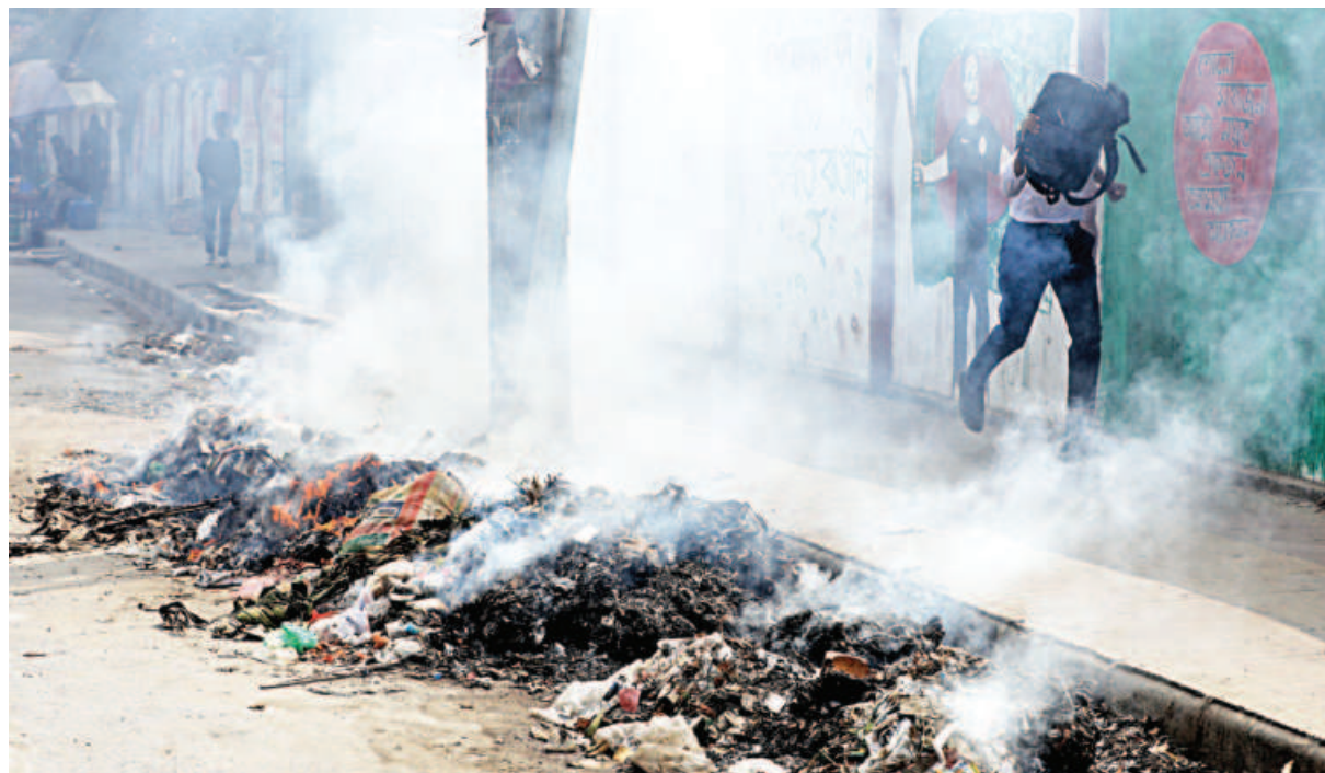
A student covers his face with his schoolbag while running past a pile of burning trash in Mohammadpur recently. The fire contributes to air pollution and harms both the environment and human health. The photo was taken near the Physical Institute Field.