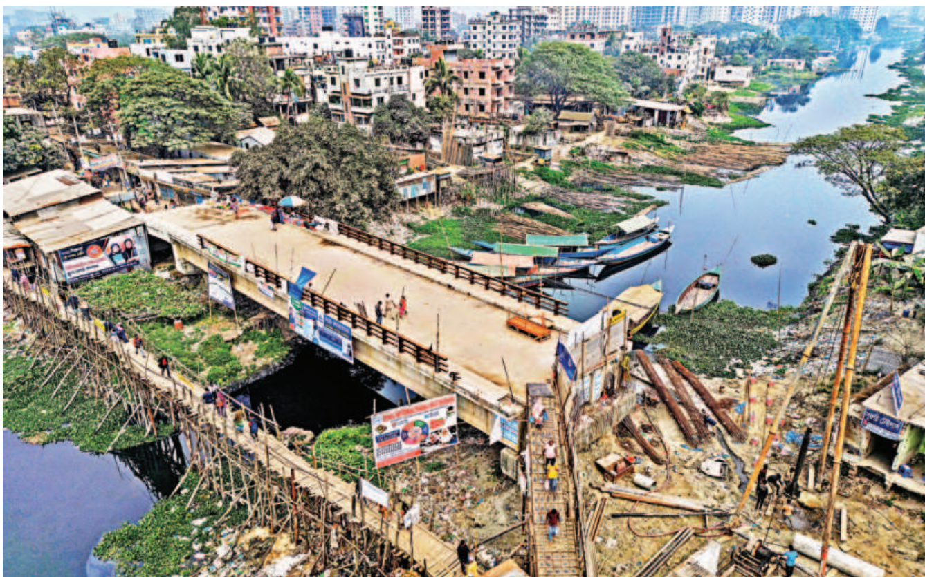
Over two years after its construction, the bridge on Ati canal in Dhaka's Keraniganj remains useless due to the lack of approach roads. Locals use a nearby bamboo bridge to cross the canal. The photo was taken recently.