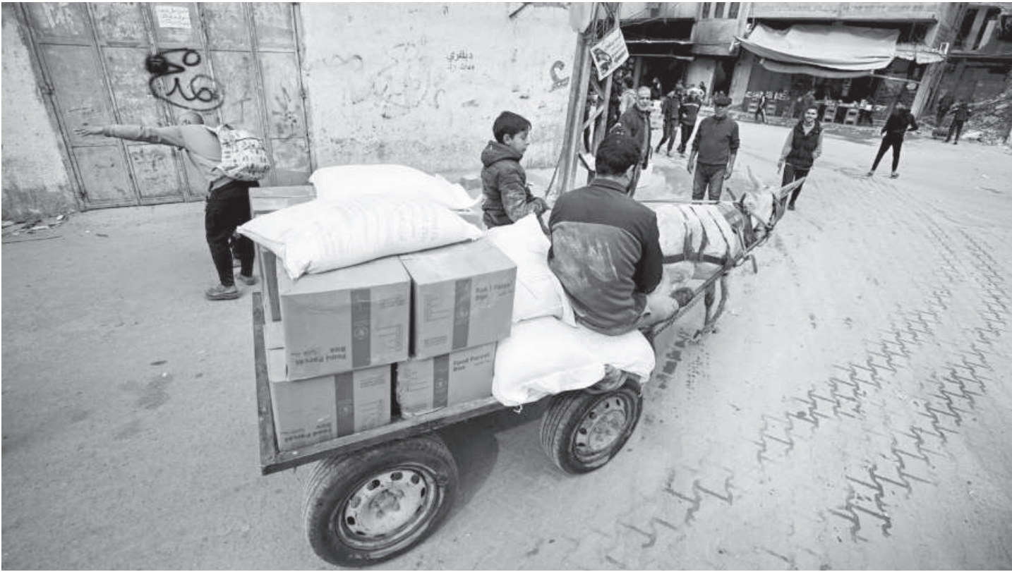
Palestinians transport aid supplies on an animal-drawn cart, amid a ceasefire between Hamas and Israel, in Gaza City on February 3, 2025.

Netanyahu, the first foreign leader to meet Trump at the White House, will undoubtedly try to preserve a dynamic where there would be absolutely no threats to his position as the Prime Minister of Israel, and he would ensure there are no checks and balance for his government—given those members are “loyal” to him. It is the same dynamic that resulted in the Abraham Accords. In this context, it is important to remember that Netanyahu’s decision in Israel has not been in the interest of the Israeli public, majority of whom do not approve of him. He dragged the war on for political gains, and got rid of anyone who objected to his decisions, in order to serve his personal interests, starting with