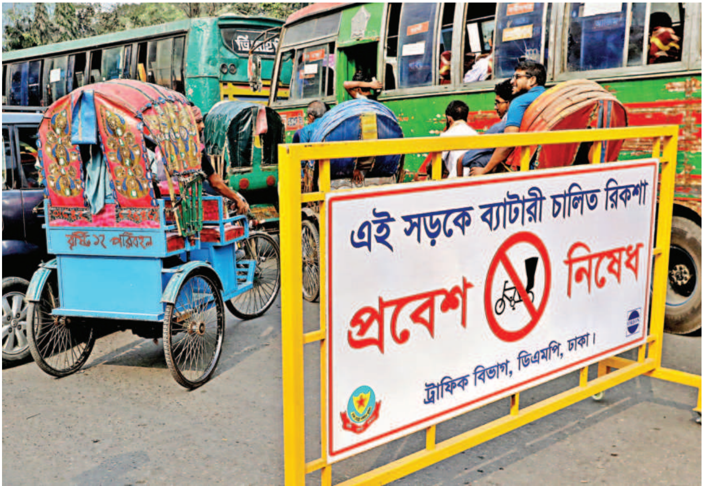
Battery-run rickshaws ply Mirpur Road, ignoring a sign that says such vehicles are not allowed there. The photo was taken near Dhaka City College around 12 noon yesterday.