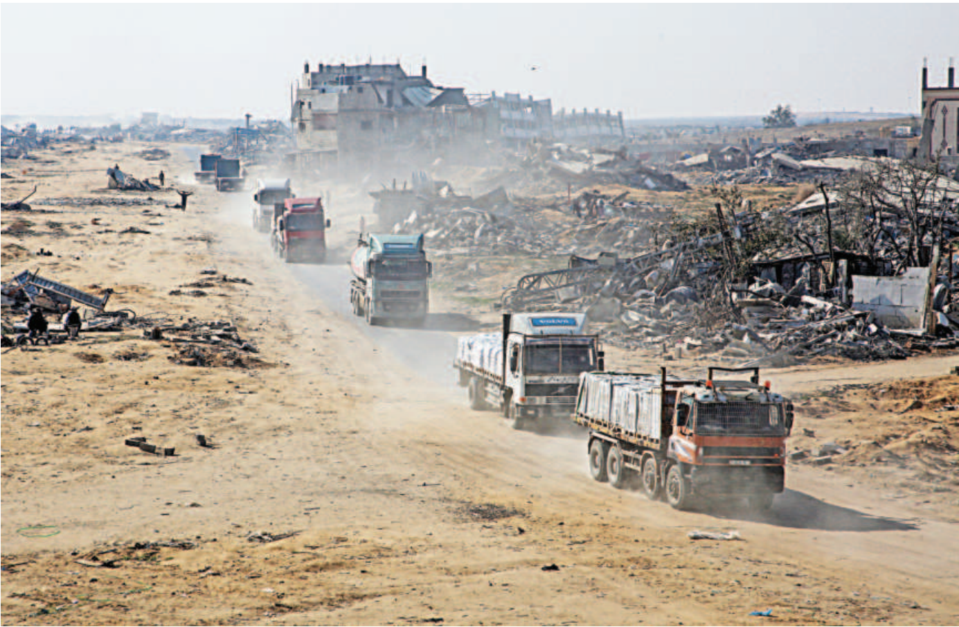
Trucks carrying aid move in Rafah in the southern Gaza Strip yesterday. Israel said it was sending a team to negotiate the next phase of a fragile ceasefire with Hamas, signalling possible progress ahead of Prime Minister Benjamin Netanyahu’s meeting with US President Donald Trump.