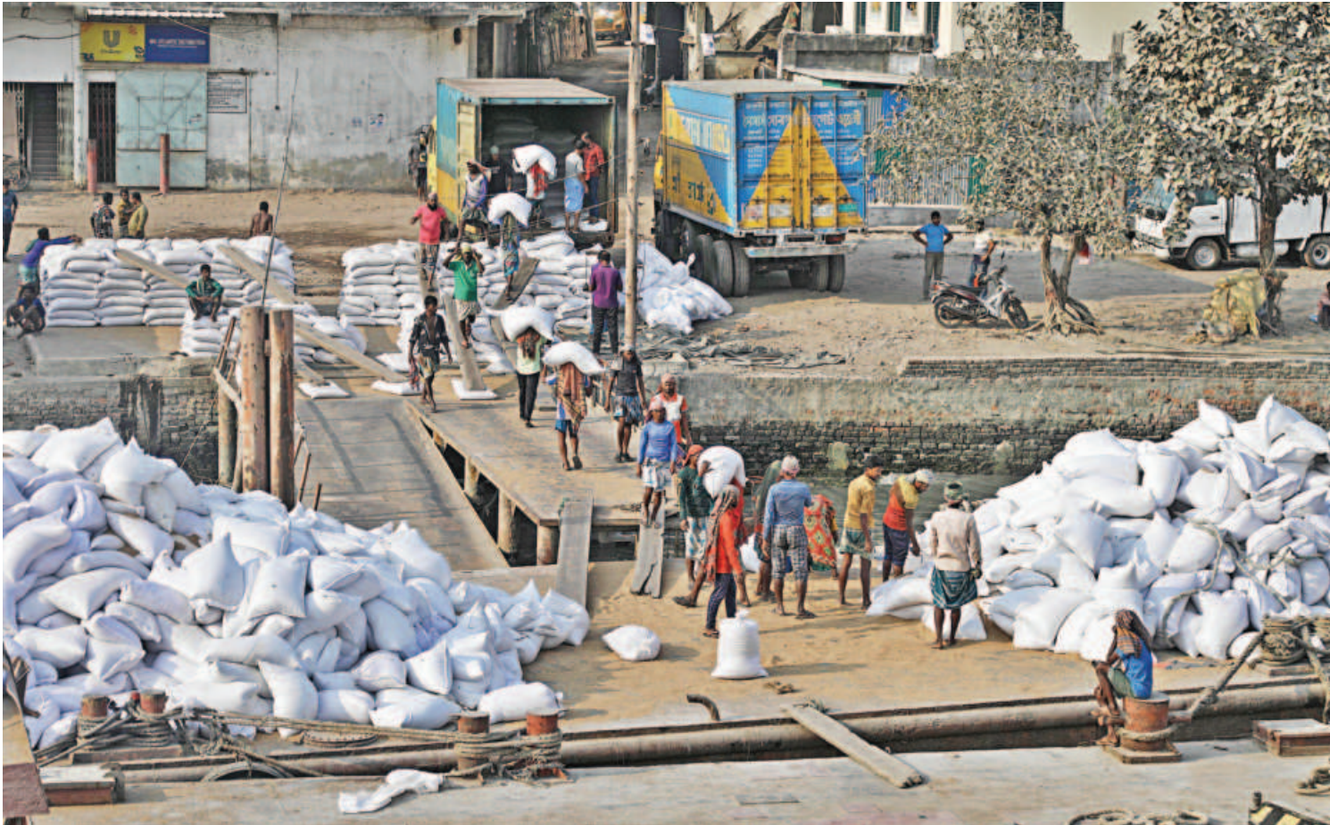
After the tumultuous days of July, August and the subsequent period of uncertainty, the import of goods has picked up pace ahead of Ramadan, which is less than a month away. The photo of workers unloading goods at a jetty was taken at Anu Majhir Ghat in Chattogram city yesterday.