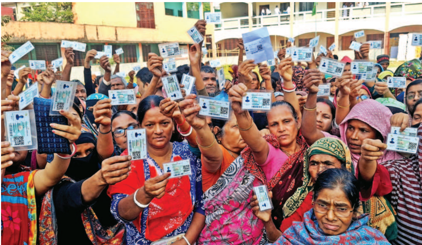
A group of former beneficiaries of the government's family card programme for low-income people show their now-invalid cards during a demonstration in the Kaunia area of Barishal city yesterday. The Trading Corporation of Bangladesh revoked the cards that allowed them to buy essentials at subsidised prices. Story on page 5.