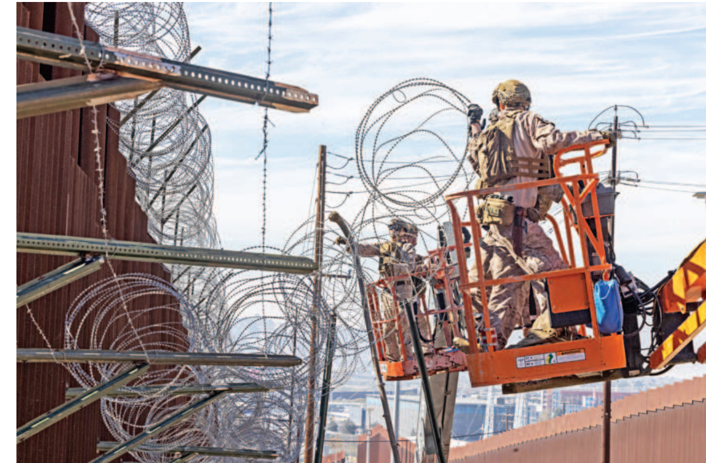
This picture provided by the US Defence Department shows US Marines from the 1st Combat Engineer Battalion, 1st Marine Division, deploying concertina wire along the southern border wall at the US-Mexico border in San Ysidro, California, on Monday.