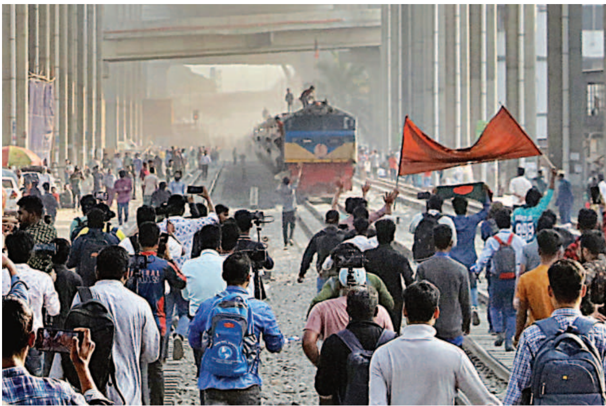
Students of Titumir College stop a train in the capital's Mohakhali around 3:45pm yesterday, demanding that the college be upgraded to a university. The blockade was withdrawn around 9:30pm following discussions between the protesters and government officials. More photos on page 3.