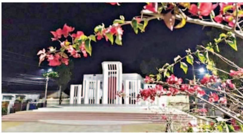
The present Central Shaheed Minar that stands in Jashore town's Bakultala area was inaugurated in 2018.

A massive procession, joined by people from all walks of life, including government employees, marched in