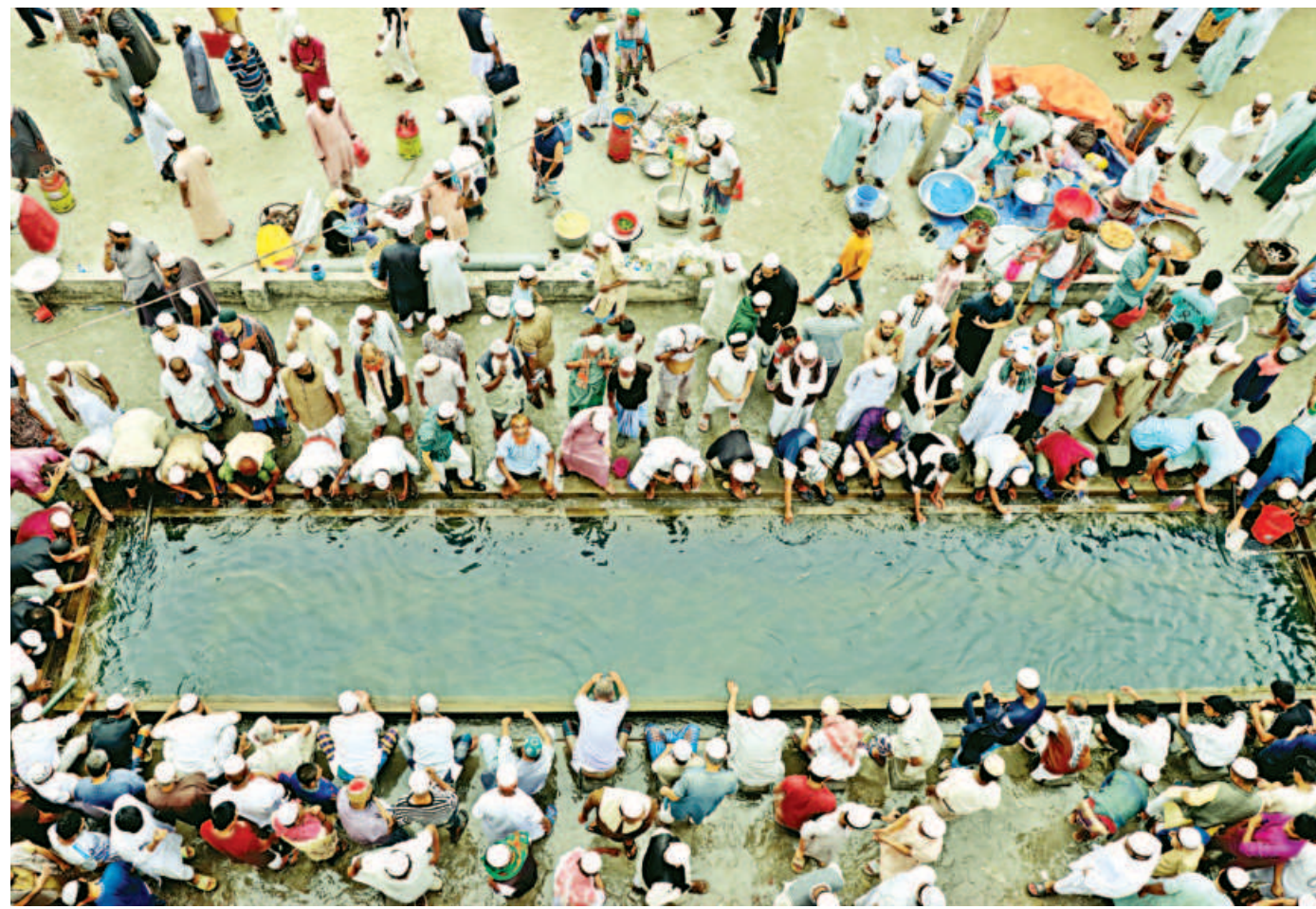
Biswa Ijtema goers perform their ablutions at a pool before offering Zohr prayers. The annual event on the bank of the Turag in Tongi sees the congregation of thousands of Muslims. The first phase of Biswa Ijtema ends today with the Akheri Munajat.