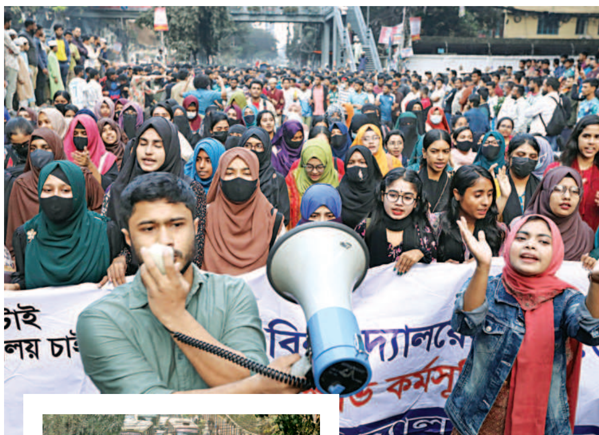
Titumir College students march on Mohakhali-Gulshan Road demanding that the institution be recognised as a university. Inset, in the afternoon yesterday, they placed bamboo across the road to block traffic.