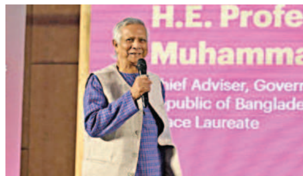
Chief Adviser Prof Muhammad Yunus speaks at the 9th Social Business Youth Summit at the InterContinental Dhaka yesterday.